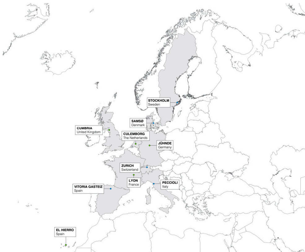
Figure 1. Geographical distribution of the case studies.