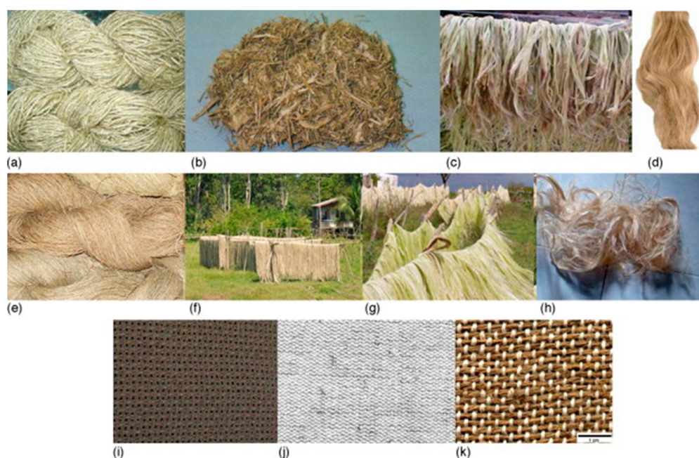
Figure 3. Natural plant Fibres (a) Banana; (b) sugarcane bagasse; (c) curauá; (d) flax; (e) hemp; (f) jute; (g) sisal; (h) kenaf; (i) Jute fabric; (j) ramie (k) jute [31].