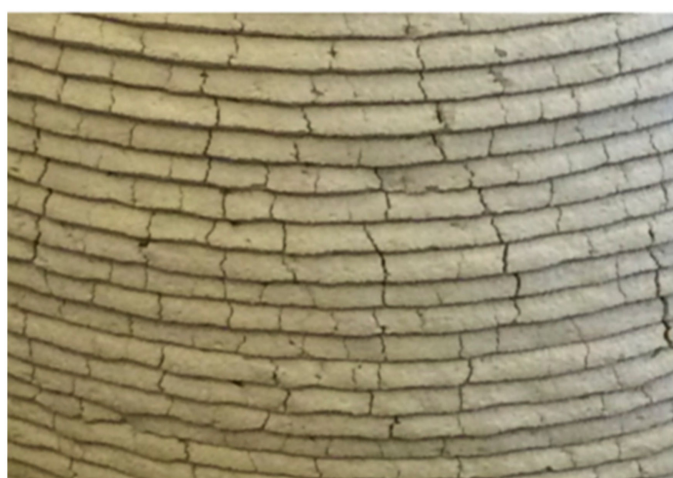
Figure 2. Excessive shrinkage cracking in an early showcase 3D printing mortar element [23].

However, the material selection and mix design are the critical limiting factor in 3D printing in concrete. In 3D printing concrete specific mixture, which is denser than the typical concrete, without coarse aggregates, steel reinforcement has to be used. Additionally, the mix design of concrete ought to meet the performance requirements of both structural and fire resistance of concrete [23]. Many mix designs have been proposed by past researches [24–29]. However, it was recognized that the mixture with retarders and accelerators, which was used to modify the setting time, showed very high shrinkage and the problem was solved with the inclusion of micro polypropylene (PP) fibres [30]. Figure 2 shows an example of an early showcase of 3D printed concrete (3DPC) structural element with shrinkage cracking. Therefore, researchers incorporated artificial fibres into the printable concrete mixture to increase the tensile properties while overcoming drying shrinkage and cracking problems. However, limited studies have been conducted on the effect of fibre incorporation in 3DPC to date. Hence, the use of such renewable material in 3DPC will potentially help for a sustainable development of 3D printing technology in the building and construction industry.