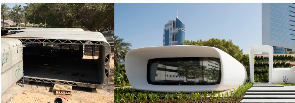
Figure 1. The world's first 3D-printed office building is in Dubai (WINSUN, [22]).

The construction industry is expected to significantly benefit from the adoption of this technology because it is believed that the technology has the potential of reducing the main issues of the construction industry like the construction time, cost, and putting construction workers at risk [20]. 3D printing technology allows buildings to be constructed without the need for the framework, which is a major benefit as formwork makes up approximately 60% of the materials, which assist in the traditional practices of concrete construction. Moreover, 3D printing has been proven to save up to 60% of construction waste, 70% of production time, and 80% of labour costs [21]. This means that utilizing this technology in the construction industry is a more sustainable way to construct building than the conventional concrete structure, and it gives architects more freedom in design. 3D concrete printing of building structures has shown success in commercial aspect. For an example, WinSun, a Chinese architectural company, were the first to develop 3D printing in construction and have since printed offices in Dubai in only 19 days by printing parts and assembling them on site as shown in Figure 1. WinSun demonstrated the potential for higher productivity in construction by directly printing 10 houses in only 24 h, showing that the technology could be deployed in many similar projects [22].