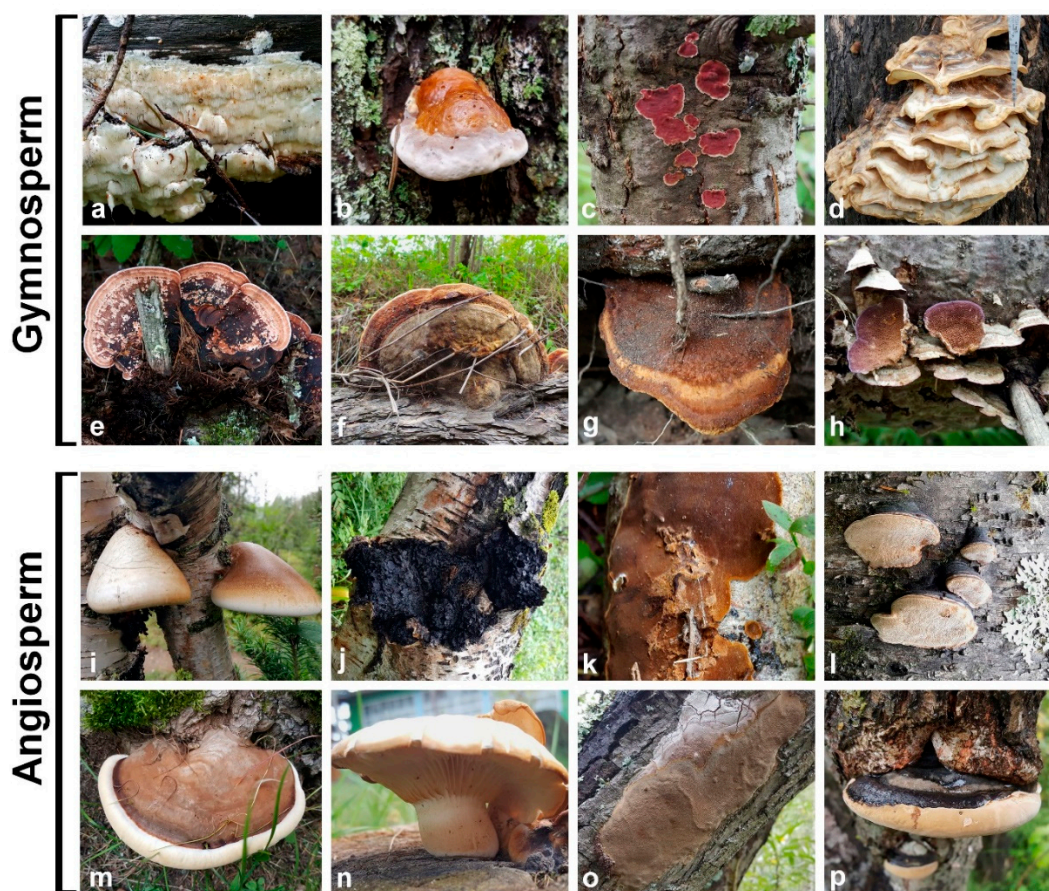
Figure 2. The major species found on each host genus in Central Siberia. a–c ( Abies sibirica ): (a) Antrodia gossypium , (b) Fomitopsis pinicola , (c) Hymenochaete cruenta ; d,e ( Larix siberica ): (d) Laetiporus montanus , (e) Rhodofomes cajanderi ; f–h ( Pinus sylvestris ): (f) Fomitopsis pinicola , (g) Phaeolus schweinitzii , (h) Trichaptum abietinum ; i–l ( Betula pendula ): (i) Fomitopsis betulina , (j) Inonotus obliquus , (k) Phellinus laevigatus , (l) Phellinus lundellii ; m,n ( Populus tremula ): (m) Ganoderma applanatum , (n) Hypsizygus marmoreus ; o,p ( Salix alba var. sericea ): (o) Fomitiporia punctata , (p) Phellinus igniarius .