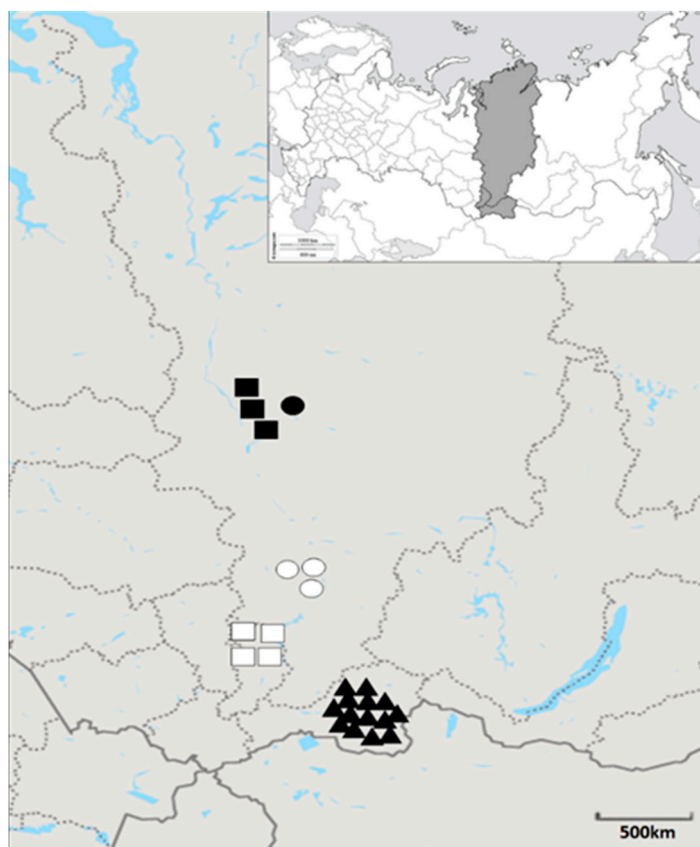
Figure 1. Location of the sampling sites in Central Siberia: open circles and squares - this study, closed circles and squares - previous literature. ●Central Siberia (Kotiranta and Shiryayev, 2016); ▲Tuva Republic, Southern Siberia (Kotiranta et al., 2016); ■Yenisein River basin, East Siberia (Shiryayev and Kotiranta, 2016); ○Krasnoyarsk, Central Siberia; □Republic of Khakassia.