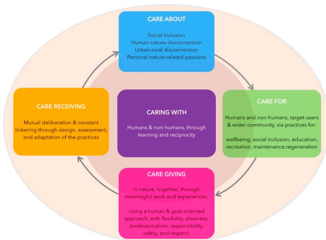
Figure 4. Empirical findings: Green Care practices across five stages of caring.

This section presents the findings from our analysis applying Tronto's five stages of caring (see Figure 4). The findings are organized for semantic coherence, using the analytical framework as guidance, and are presented accordingly with the observed patterns that emerged from the data analysis. We make ample use of quotations to give a vivid account of the everyday experiences and their significance. These quotations are placed within brackets, indicating the source (with P standing for practitioner, S for external stakeholder, and C for the disabled customers involved in the PhotoVoice project) and method used (Int. stands for semi-structured interview; V-Int. for Video interview; Sha-workshop for Sharing and Reflecting co-creation workshop; Fut-workshop for the Envisioning the Future co-creation workshops; Photo for PhotoVoice). The full list of research participants, divided per case study, is provided as Appendix A in Table A2. (All subjects gave their informed consent for inclusion before they participated in the study. The study was conducted in accordance with the Declaration of Helsinki, and the protocol was approved by the Ethics Committee of the Wageningen School of Social Sciences).