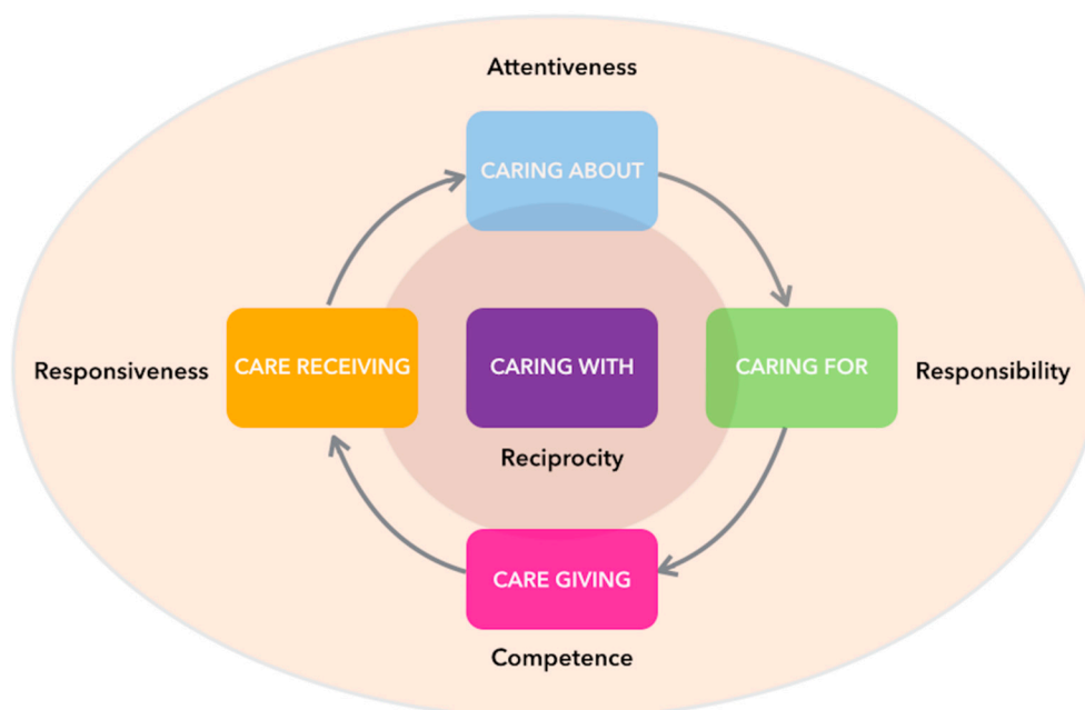
Figure 1. Five stages of caring and related moral principles. Inspired by Tronto (2013).

process, with each stage represented by a practice that is motivated and activated by a moral principle. A visual representation of the five stages is provided in Figure 1.