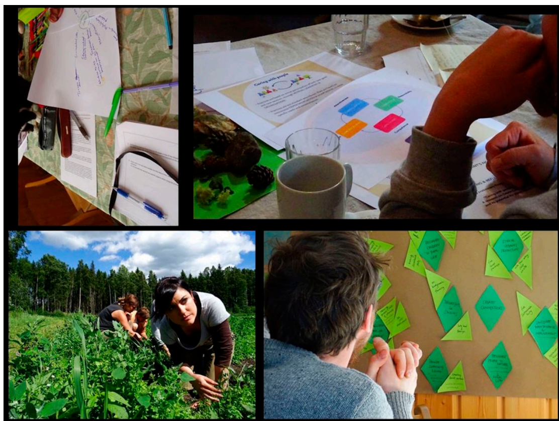
Figure 3. Methods of data collection. From left to right: Semi-structured interview and participatory mapping; Sharing and Reflecting workshop; participant observation; Envisioning the Future workshop.

Figure 3 provides a visual documentation of some of the methods described above.