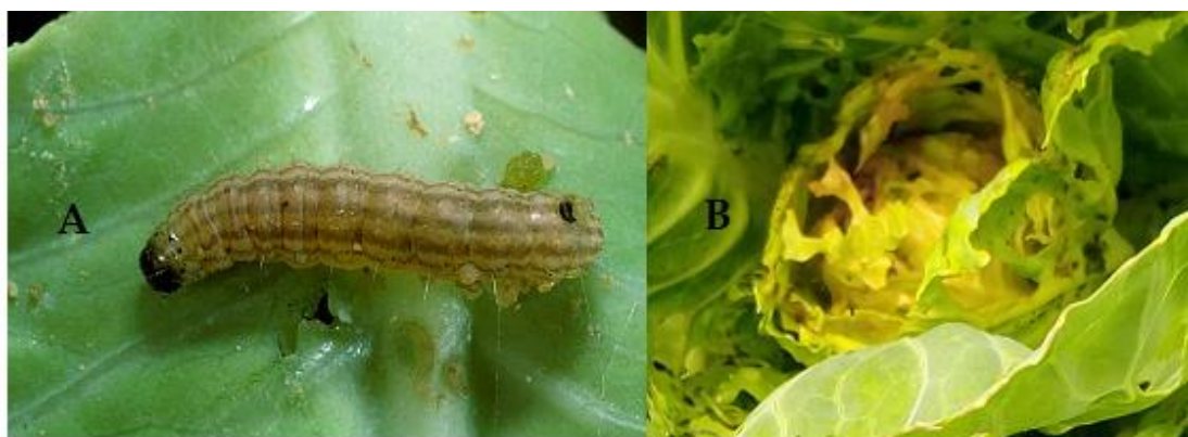
Figure 2. (A) Mature larva of the cabbage webworm, Hellula undalis . (B) The cabbage plant head damaged by larva of H. undalis .

Among the most destructive insect pests which attack cruciferous vegetables is the cabbage webworm (Figure 2A) ( Hellula undalis ) (Lepidoptera: Pyralidae) [44]. The cabbage webworm ( Hellula undalis ) is a major pest of cruciferous crops in the tropics and subtropics [45]. It is a widespread species in the world especially in Europe across Asia to the Pacific and also, in African countries [46,47]. Shine et al. [48] reported that H. undalis is distributed mostly in tropical and subtropical regions but can similarly be found in countries with moderate climates.