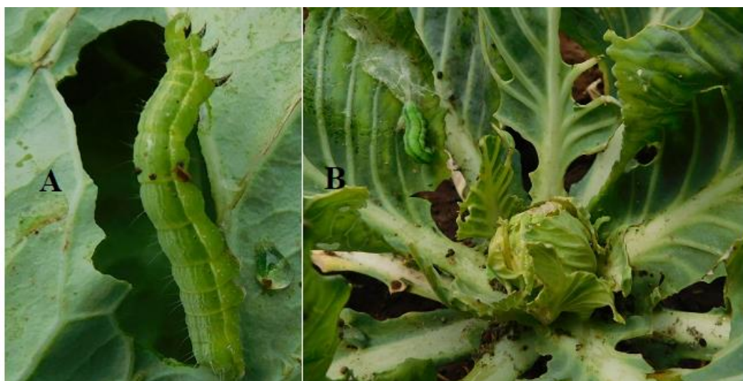
Figure 1. (A) Mature larva of the cabbage looper, Trichoplusia ni . (B) The cabbage plant damaged by Cabbage looper larva.