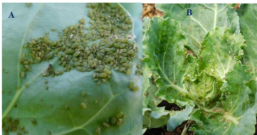
Figure 5. (A) Green peach aphids, Myzus persicae . (B) The cabbage affected by green peach aphids.

The green peach aphid, ( Myzus persicae ) (Figure 5A), is found throughout the world and can be present at any time throughout the year [78]. Generally, its color is pale green, and there are two forms of green peach aphids; winged and wingless forms [79]. The green peach aphid have prominent cornicles on the abdomen that are markedly swollen and club like in appearance [70]. The frontal tubercles at the base of the antennae are very prominent and are convergent [79]. Winged forms of the green peach aphid have a distinct dark patch near the tip of the abdomen; wingless forms lack this dark patch [80]. The green peach aphid is adapted to high environmental temperatures [78].