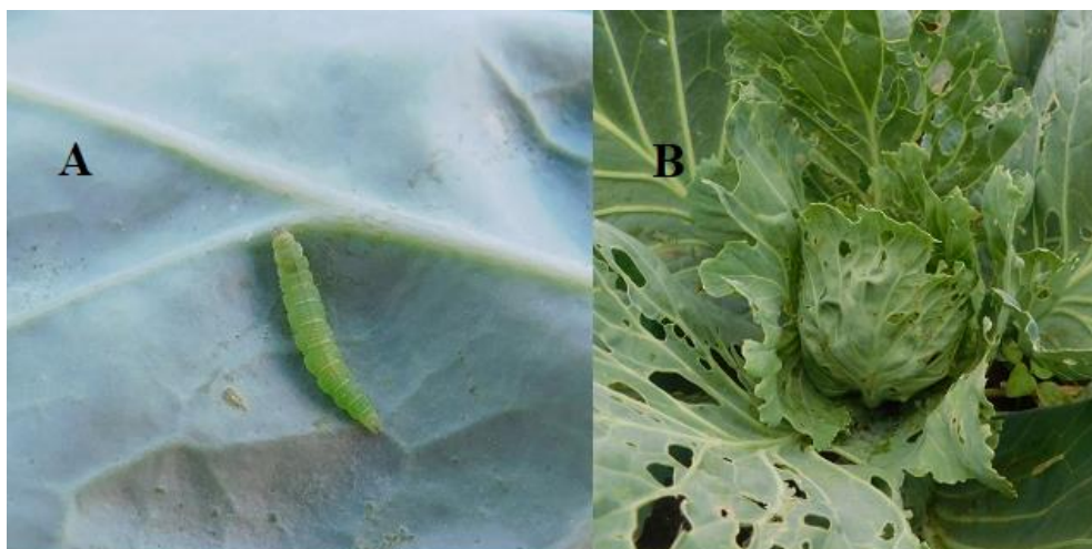
Figure 3. (A) Mature larva of the Diamond back moth, Plutella xylostella . (B) The cabbage plant damaged by larva of P. xylostella .

to control this pest instead of relying on the synthetic pesticides which have many negative impacts and problems to the environment. The benign and environmental friendly control measures with broad spectrum of the activities are the botanicals (phytochemicals), the chemicals from pesticidal plants [24]. Those alternatives with antifeedant, repellency and insect growth regulators of their natural origin having non-neurotoxic modes of action to human being and low environmental persistence can be applied.