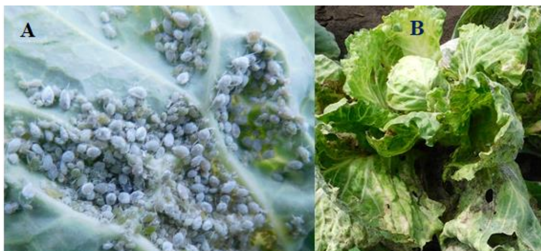
Figure 4. (A) Cabbage aphids, Brevicoryne brassicae . (B) The damaged plant cabbage by cabbage Aphids.

According to Elwakil and Mossler [71] and Lashkari et al. [72] cabbage aphids (Figure 4A) have direct and indirect damaging effects to cabbage crops. The direct damage caused by this pest is by sucking cell sap, secrete honey dew which result into sooty mold formation on leaves and shoots and indirect damaging effect is as a vector of 20 plant viral diseases in a wide range of plants. According to Valenzuela and Hoffmann [73], the damaging viruses transmitted by cabbage aphids are such as potato leafroll virus, potyviruses, beet western yellows, beet yellows, cauliflower mosaic, cucumber mosaic, lettuce mosaic, turnip mosaic and watermelon mosaic. High population and feeding of cabbage aphids result into curling, distortion and yellowing of leaves, stunting plant growth, deforming developing heads, damaging of flowers and green pods and discoloration of any growth stage and part of plants [64,67]. Feeding by cabbage aphids can stop terminal growth resulting into reduced plant size and yield [74].