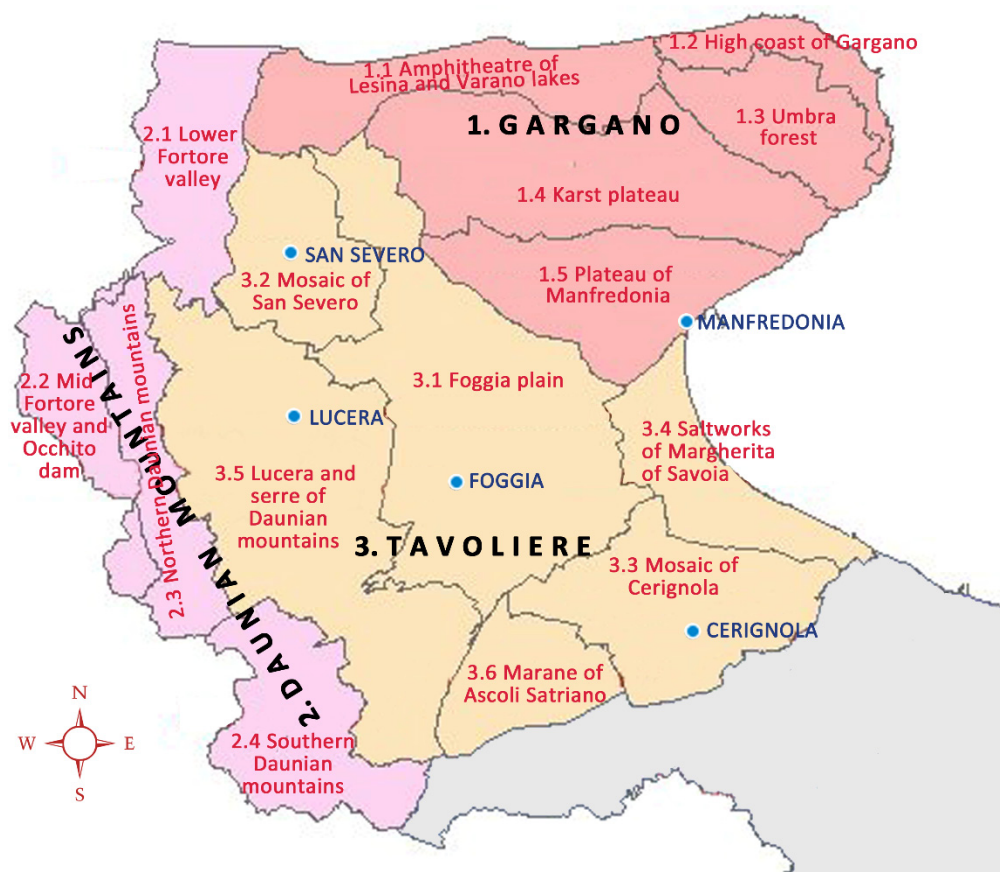
Figure 1. Landscape types (LT) (pink: Gargano; violet: Daunian Mountains; and yellow: Tavoliere), relative landscape units (LU) and the five most important cities in Foggia.

ecological value due to the preservation of seminatural/natural ecosystems. Protected areas (62% of the total) are represented by Gargano National Park. Agricultural activities are typical of marginal lands (almost 30% of the total) where grazing is widespread and the arable agriculture consists of non-irrigated crops along with olive groves, frequently placed on artificial terraces. Consistently, soils show a restriction level to cultivation ranging from limited to very severe or even unsuited to cultivation.