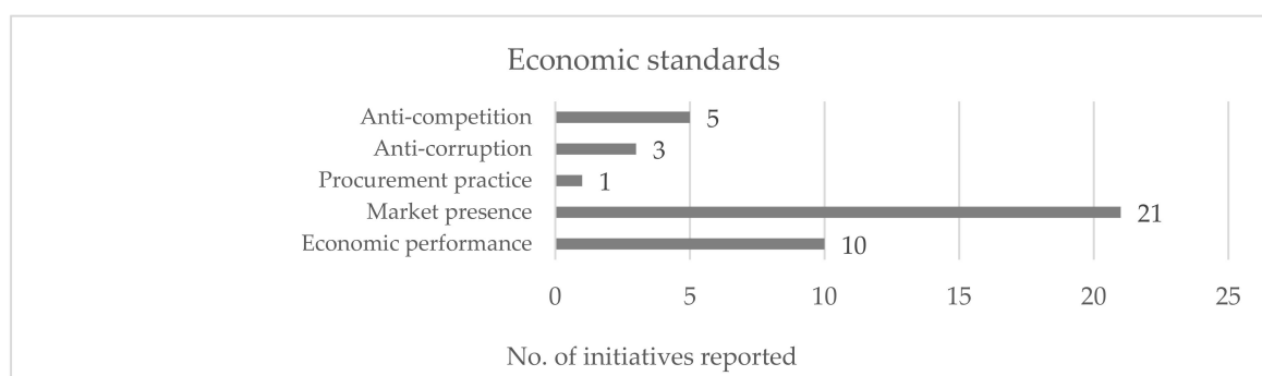
Figure 1. Number of China-specific sustainability initiatives belonging to Global Reporting Initiative (GRI) economic standards.

With reference to environmental initiatives, a substantial convergence of the strategies implemented by companies was observed (Figure 2). Coherent with the Chinese government agenda that includes green development within the broad concept of national growth [62], luxury companies reported their strong commitment to environmental initiatives like the implementation of energy, water, and waste efficiency standards and certification and the adoption of ethical practices of key materials sourcing such as cashmere, gold, or silk.