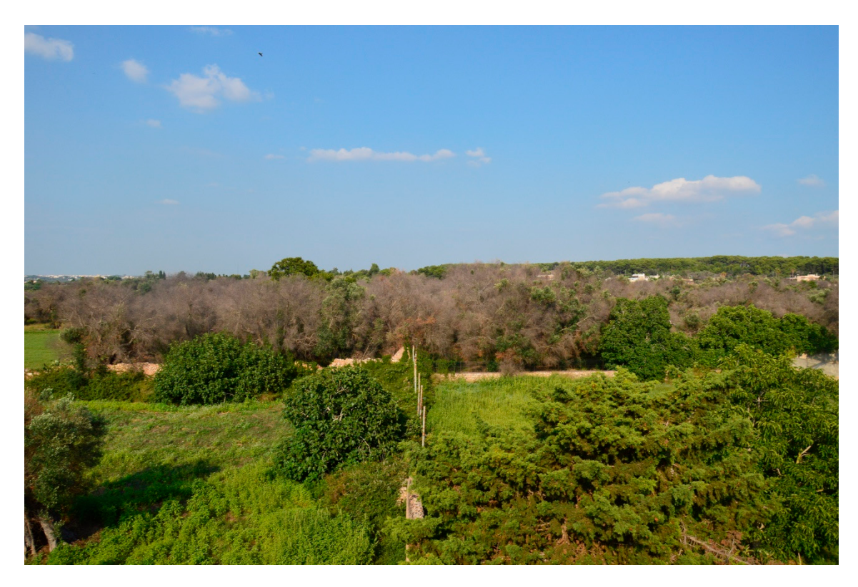
Figure 5. Panoramic view of dead olive trees in the study, highlighting the state of desiccation of the olive groves.

The species detected for the herbaceous vegetation belong to the ruderal type, which characterize land exploited for human activities of low ecological value and not relevant for food or medicinal uses.