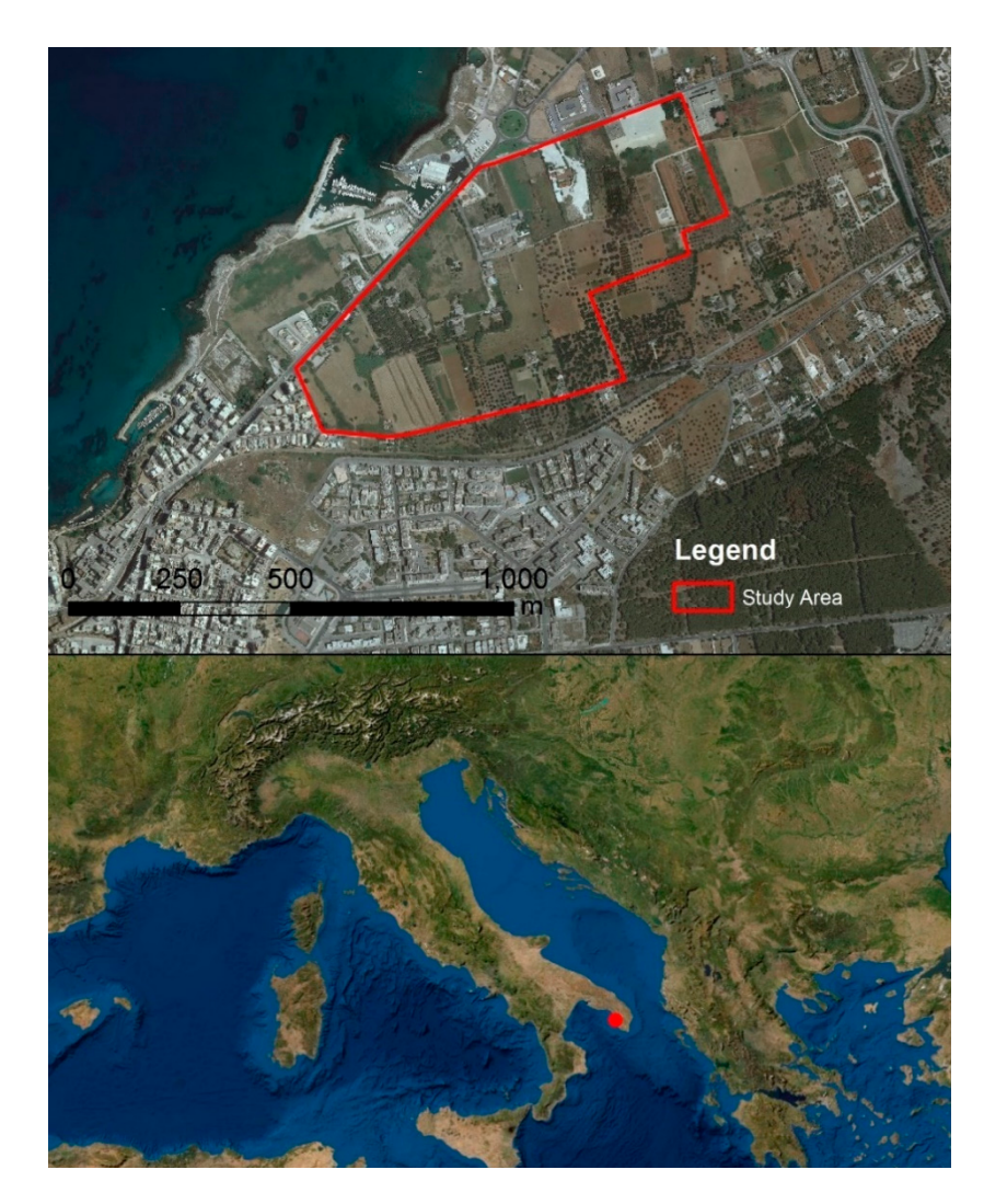
Figure 1. Study area.