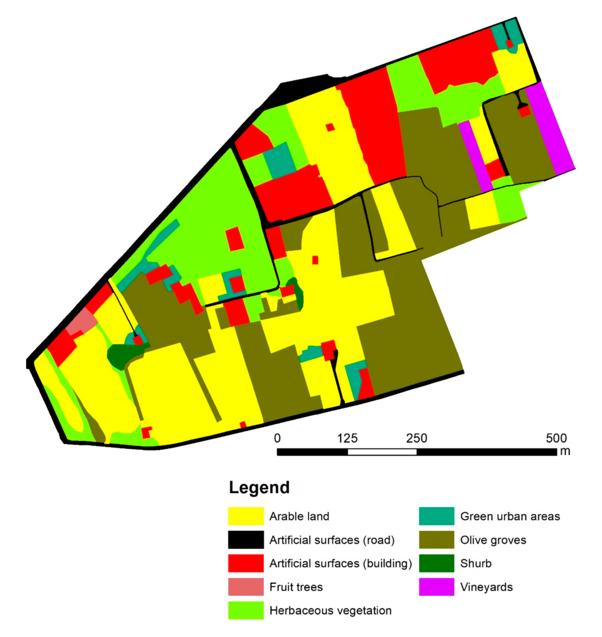
Figure 3. Spatial configuration of the main land use of the study area.