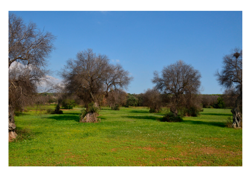
Figure 4. Example of the olive trees affected by Xylella fastidiosa in the study area, highlighting the state of desiccation of the monumental olive trees.

Table 4. Qualitative characterization of the ecosystem service provision linked with the main land use in the study area. -, not relevant for ecosystem services [13,34,44].