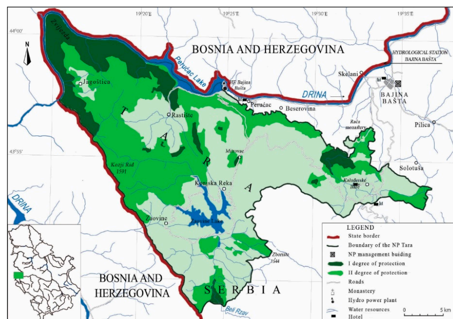
Figure 1. Location of the study area.

The Tara National Park is located in the west part of Serbia, on the border with Bosnia and Herzegovina, and it covers the largest part of the Tara Mountain. The Tara Mountain is delimited to the north and west by the elbow valley of the Drina River, to the southwest by the valley of the Rzav River, and to the south by the Kremna valley, which separates it from the Zlatibor Mountain (Figure 1). This mountainous area is a unique geographic entity, reaching about 45 km in length and up to 18 km in width; the average elevation is 1200 m a.s.l., and its highest peak is Kozji Rid (1591 m a.s.l.) [66].