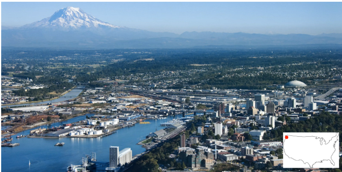
Figure 1. The port city of Tacoma, Washington, located in the Pacific Northwest of the USA on the estuary of the Puyallup River. (Image courtesy of sporcle.com ).

For example, in the waterfront city of Tacoma, Washington in the U.S., the port was initially dredged and constructed over nearly half a century of urban development, transforming the ecologically diverse conditions and culturally significant locations of the Puyallup River delta and estuary into a working, industrial waterfront of intense commercialization and commodity transfer (Figure 1). In recent years, declining spatial needs for traditional maritime uses have resulted in a redevelopment of the historic waterfront focused on more civic and residential development including the recent creation of the Dune Peninsula public park, built on the refuse of previously industrial land uses. These shifts in waterfront development have established a hybridity of land uses and introduced new actors for determining the diverse needs of industrial, commercial, residential, and recreational needs in the contemporary city.