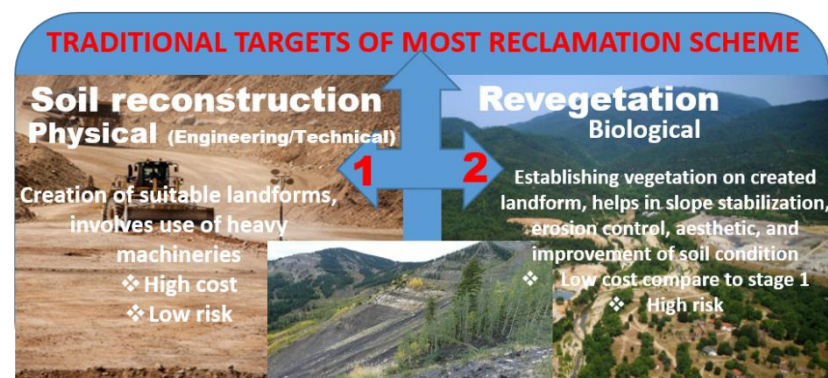
Figure 1. Common targets of most reclamation scheme.

Landscape reclamation schemes are in several cases trial-by-error and sometimes entail rebuilding the ecosystem from bedrock. The traditional targets are (1) backfilling and soil reconstruction using machines, energy, and geological materials followed by (2) biological materials for revegetation [3] (Figure 1). Summary of its key objectives is to reduce potential damage, prevent negative impacts to the environment within and near the mined areas, restore the viability and vegetation potentials of the soil, compensates, and maintain or improve the landscape aesthetic values coupled with few functional qualities [4,23]. These efforts have resulted in the development and improvement of several evaluation schemes [3,8,9,24], which are mostly limited to the analysis of the reclaimed sites' revegetation cover or plant community, soil erosion protection, landscape hydrologic functions, and aesthetic values [3]. Several ecosystem components and processes are not considered which are crucial for ecosystem functions, services, and sustainability [25]. The soil properties are mostly below standard. Additionally, so are the air and water quality, climatic conditions, and other essential ecosystem components [26–29]. Therefore, due to its characterized challenges, most post land-use options cannot cater to the downstream ecological hierarchy and productivity demands.