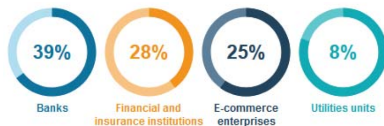
Figure 2. Distribution of surveyed companies by business profile.

The next step (Step 4) of the research process involved surveying the representatives of Polish service enterprises. The research was conducted among 110 representatives of Polish banks, financial and insurance institutions, media, utilities units and e-commerce enterprises. The survey was directed to the management staff, mainly chief technology officers, chief information officers, chief operating officers, heads of back offices, security, financial and sales departments as well as other employees responsible for technology and development of enterprises operating in the service sector. Figure 2 depicts the distribution of the service companies by business profile.