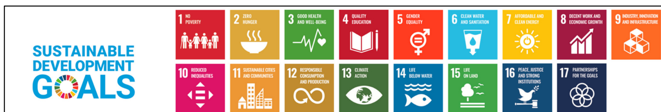
Figure 1. Sustainable development goals [74].

Additionally, in recent years, we have witnessed an increase in academic literature reporting the outcomes of AI technology applications for social good, and in tackling social and environmental issues [66]. The environmental areas in which AI applications are utilized range from air pollution monitoring [67] to wastewater treatment [68], from endangered species protection [69,70] to climate change detection [71], from natural disaster prediction [27] to ecosystem service assessment [72], and other applications in environmental sciences [73].