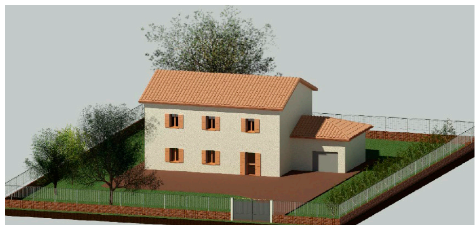
Figure 1. Rendering of the reference building.

The survey questionnaire was structured into five sections. In Section 1, the research topic and aim are introduced to respondents to increase their knowledge on PV plants and their engagement in the survey and motivate the research. Some information about the effects of climate change and GHG emissions related to energy consumption is presented. The 2030 and 2050 European targets for the mitigation of climate change are briefly described. In addition, respondents are informed that renewables, such as PV solar energy, are a key factor in the energy transition from fossil fuels to renewables and the benefits generated by PV production (e.g., GHG emission reduction, cost savings due to self-consumption, etc.) are listed such as GHG emissions reduction and energy cost savings on energy bills due to self-consumption. In Section 2, the valuation scenario is presented, and a rendering of the detached house and a detailed description of the asset's characteristics are provided (Figure 1).