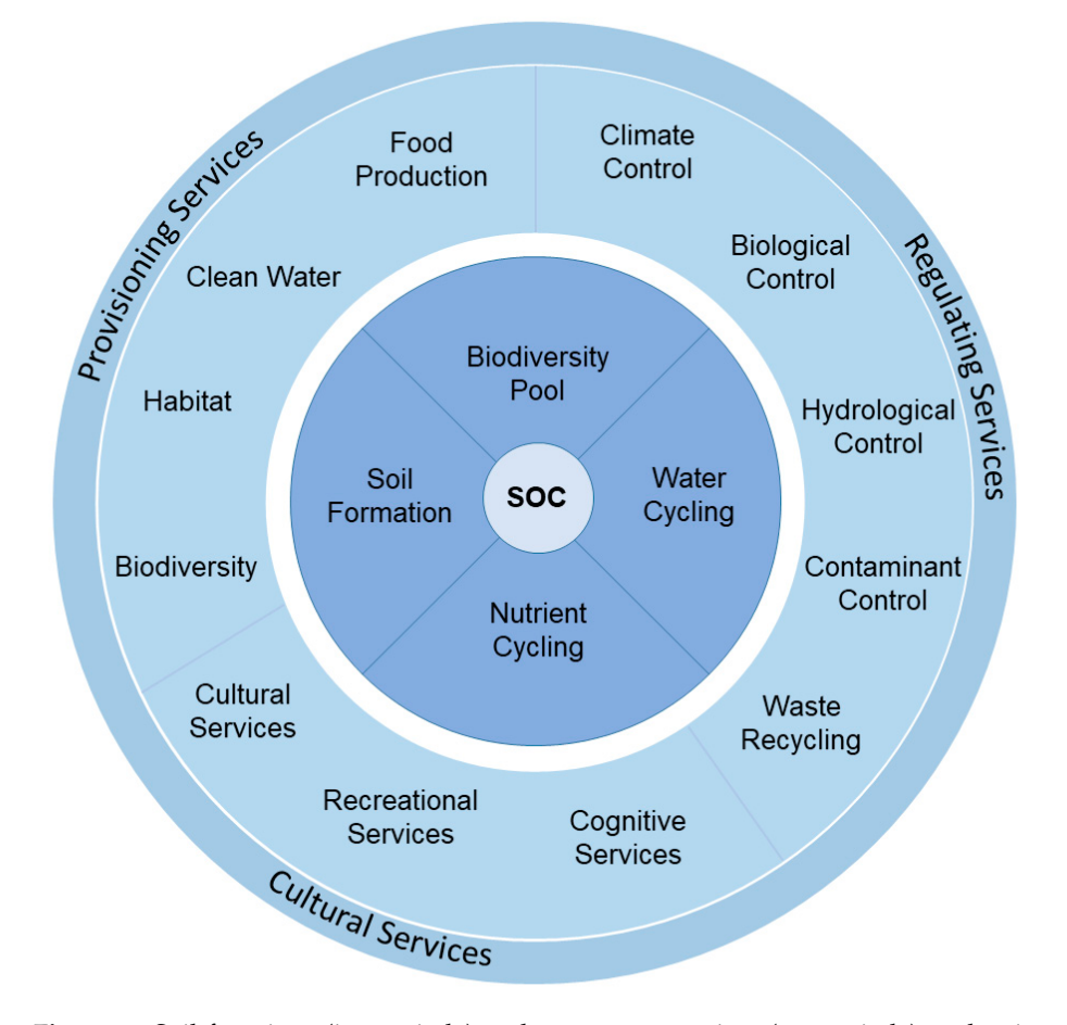
Figure 1. Soil functions (inner circle) and ecosystem services (outer circle) underpinned by soil organic carbon. Adapted from Laban et al. [34].