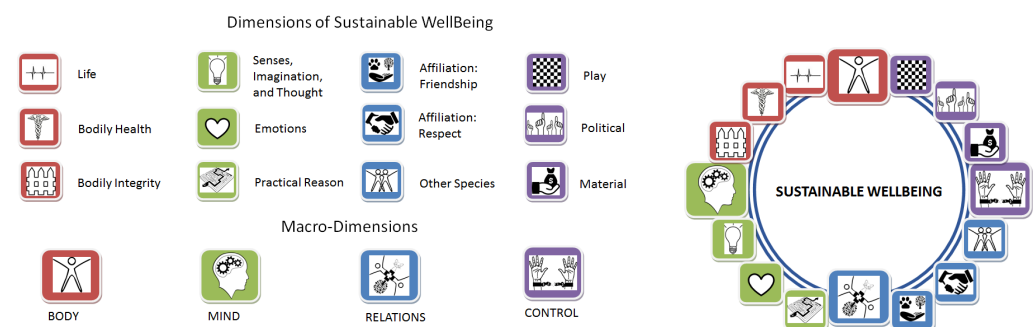
Figure 1. Dimensions of sustainable wellbeing.

Based on the central capabilities approach of Martha Nussbaum [25], 12 dimensions, grouped in 4 macro-dimensions, were considered as components of sustainable wellbeing (see Figure 1). Subsequently, the indicators associated with each of the dimensions were identified [28]. Finally, these results are integrated into the macro-dimensions until reaching the final aggregate of sustainable wellbeing.