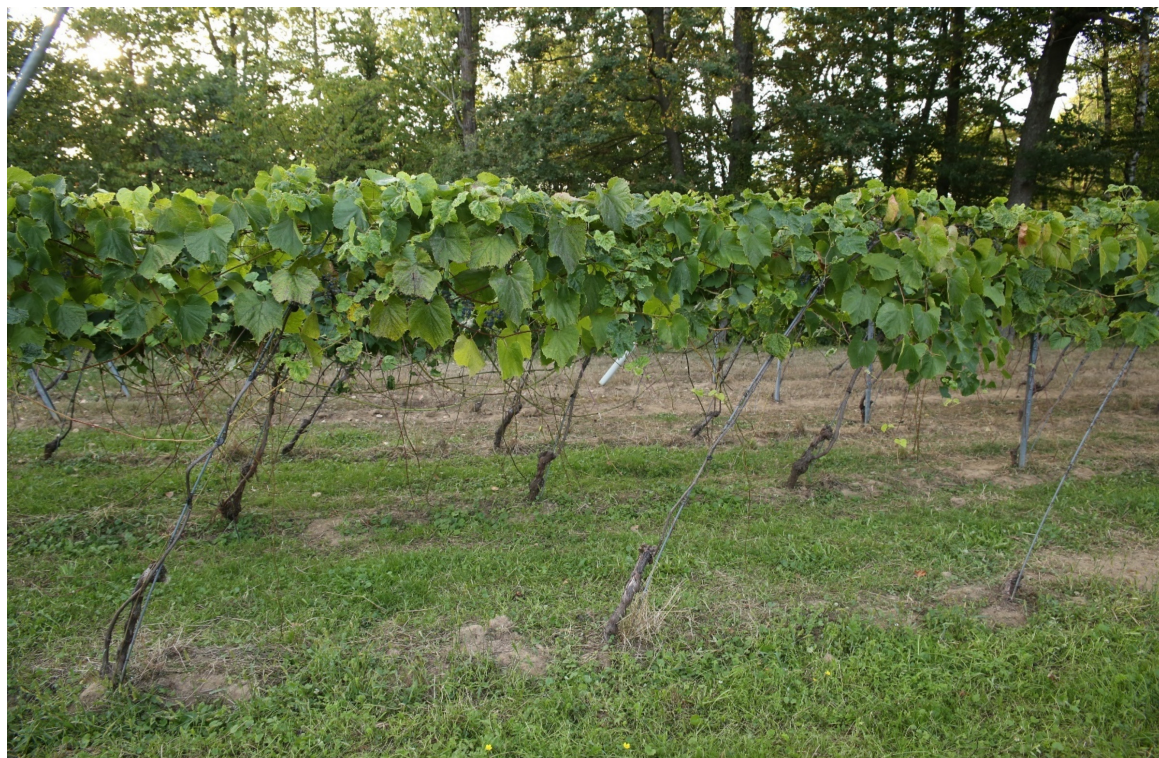
Figure 2. Sheep-grazed vineyard with a top-wire cordon training (hanging cane). Here, the wire is at ~160 cm height.