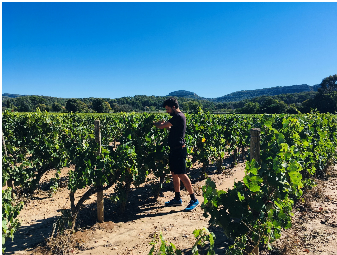
Figure 4. A typical vine training system in France (Département Ardeche). The first wire is at ~55 cm height, thus the grape zone would be damaged with summer grazing.