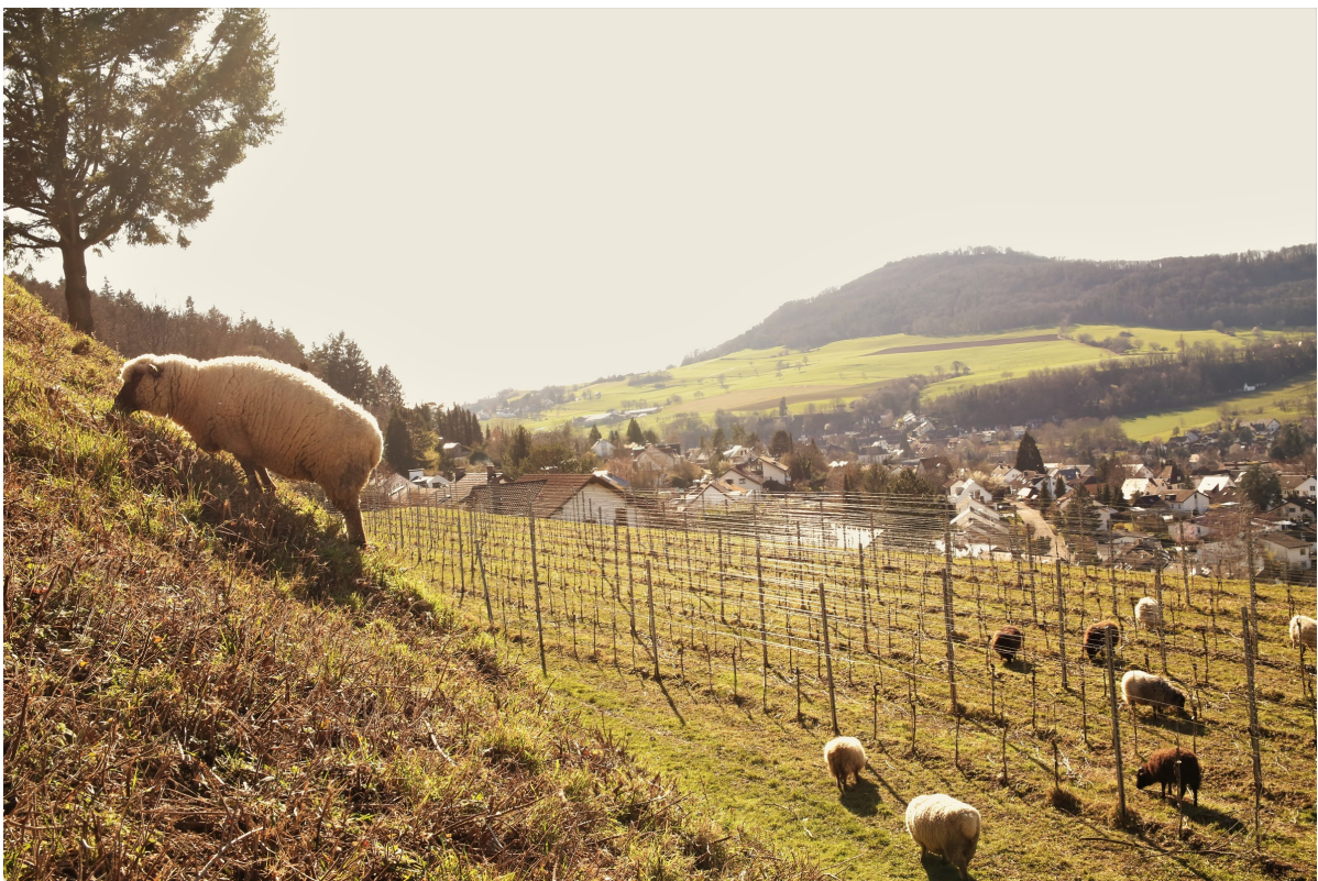
Figure 7. Sheep grazing a vineyard in the period of vine dormancy. In Central Europe, many vineyards have deep terraces. Sheep are able to graze here, so that mulching is no longer required. This is an improvement especially for insect conservation [25].

In Central Europe, vineyards are often located in climatically favourable sites and regions that are of particular interest from a nature conservation point of view. A range of thermophilic species are often located there. Whether the use of sheep actually correlates with improvements in the nature conservation of these habitats and of target species (e.g., the smooth snake) is not least a question of grazing management, which in turn depends on viticulture requirements [20] (Figure 7).