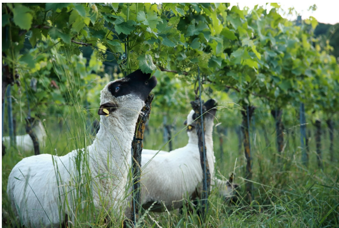
Figure 6. Sheep of the Danish Shropshire breed (and at least some of those crossed with the English Shropshire) seem perfect for leaf plucking. The breed is not able to stand on two legs. This was confirmed for adult animals but not yet for lambs [18].