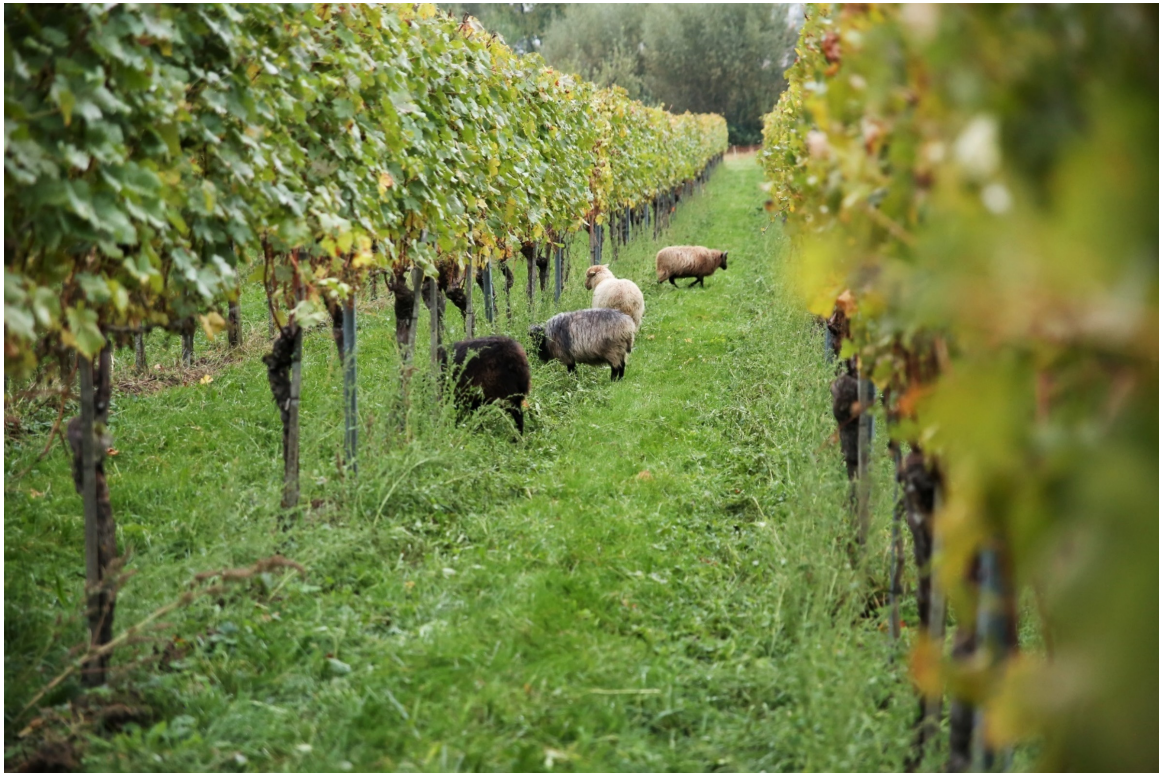
Figure 1. Sheep of the Ouessant breed are grazing a spalier training system with Guyot pruning. This training system is widely used in Central Europe. Here, the first wire is at ~90 cm height.