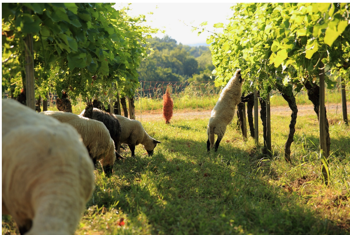
Figure 5. Most sheep breeds are able to stand on two legs, which is unfavourable in common vine training systems. This skill enables sheep to defoliate too high up the vine. While leaf plucking in the grape zone is highly welcome, defoliating well above the grape zone causes production losses and grape sunburn [15].