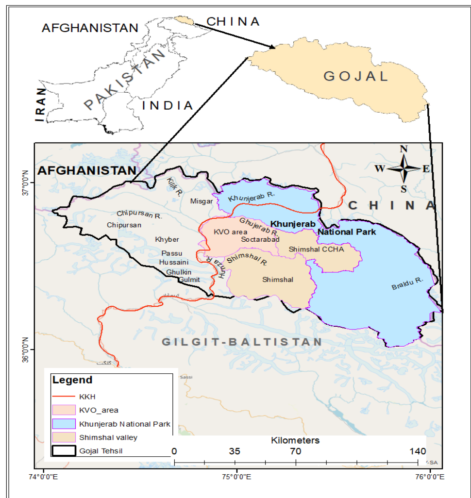
Figure 1. Map of the study area (coloured) in Gojal sub-district, Hunza, northern Pakistan.

The study area lies inside the Khunjerab National Park (KNP) and valleys in KNP's buffer zone (the Khunjerab and Shimshal valleys) in the Gojal subdistrict of the Gilgit Baltistan province, encompassing approximately 8582 km 2 (36°33' N to 37°01' N; 74°52' E to 76°02' E) [40,47] (Figure 1). The altitude of the study area varies from 2439 m to 7885 m above sea level [40,48]. Precipitations range from 200 to 900 mm per annum, and most precipitation is in the form of snow in winter. Average temperatures range from below 0 °C from October onward and rise to approximately 27 °C in May [49].