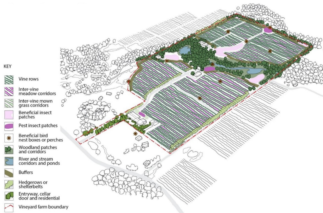
Figure 3. Integration of sharing and sparing green infrastructure systems across a vineyard farm providing multiple ecosystem services and functions.

may succeed in reducing external system inputs through this approach, it may lead to their isolation within their vineyard landscapes. There are many potential economic and ecological benefits associated with integrated farm systems, not just with neighbouring farms, but with farms across regions landscapes [55]. In terms of GI systems, some ecosystem services and functions can only be achieved at spatial scales coarser than an individual farm. For example, a catchment-wide approach is needed to effectively design for high surface water quality in support of Pacific salmon, and a landscape scaled approach is often needed to provide habitat networks in support of species of conservation concern. Regional branding also requires a coarser scaled design approach. Achieving these coarser scale design goals requires the involvement of neighbouring landowners, local communities and regional governments in farm decision making [17,26]. Key steps toward this integrated approach are: (1) The design of GI as integrated whole farm networks (Figure 3), and (2) working with immediate neighbours to extend key GI networks onto adjacent properties. Figure 3 provides an illustration of how the conventional vineyard farm depicted in Figure 1 might be transformed into a more sustainable and resilient biodiversity-based vineyard farm through the integration of the GI components and networks identified in this research.