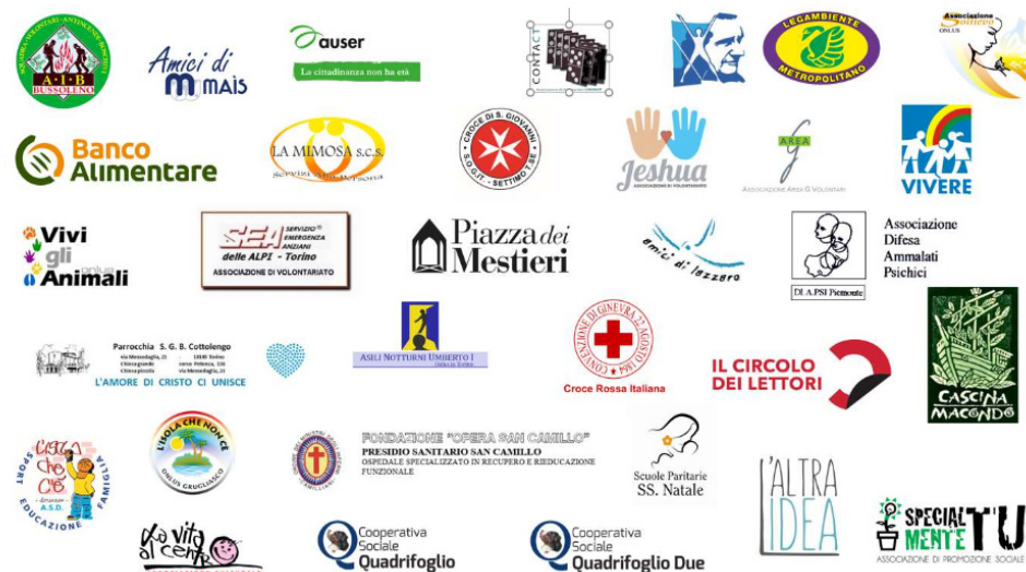
Figure 1. The host organizations of civil service Vol.To.

The representation of the impact of activities and stakeholders is made even more complicated as each third sector entity has one or more public, private or third sector entities as a partner (Appendix A).