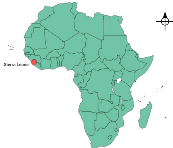
Figure 1. Map of Sierra Leone.

climate change is already tangible in the agricultural sector. For instance, crop production is affected by prolonged periods of dry days even during the rainy season, while heavy rains in dry season (March) results in excessive weeds growth [18]. Existing climate models predict an increase in average temperatures between 1 and 2.6 °C by 2060 [19]. Further, Sierra Leone's cocoa farming faces formidable challenges with increasing maximum dry season temperatures, which can significantly reduce the area suitable for cocoa crop [20].