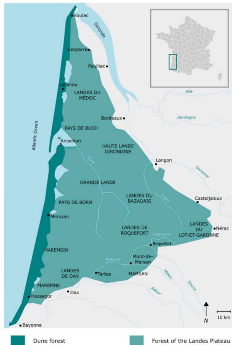
Figure 1. Location of Landes de Gascogne forest.

Landes de Gascogne forest is unique in Europe because it is almost entirely created and managed by man for specific industries. This forest was planted first to contain littoral dunes in the middle of the 19th century. The trees were then utilized for their resins and the forest was further developed and planted inward by Napoleon III. From the harvest of resin to maintain wooden ships, to the use of turpentine for lanterns and light, to the production of timber for mining and railway infrastructure, the economic applications of this unique forest have evolved throughout the years, fueled by market changes. Currently, the regional raw material flow of timber resources rests within market pulp and wood packaging. The harvesting technique is machinery harvesting only. The machine cut the trees in 2.5 m logs (100 inches). Today, the production of wood, populated only with maritime pine, occupies 897,000 hectares out of the 1,166,000 hectares of the Gascony forest. The rest (269,000 hectares) is shared between the coastal protection zone and about 100,000 hectares of oaks and various other species [13]. The majority of the forest is PEFC (Programme for the Endorsement of Forest Certification) certified. The production and allocation of timber products has never been static throughout its history, and moving forward into the future, this resource may pivot once again [14].