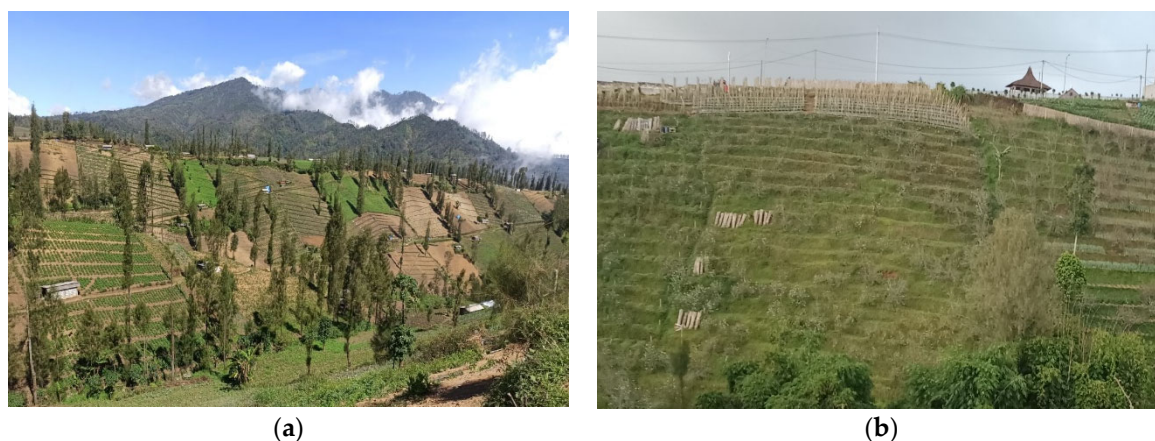
Figure 2. Agroforestry and non-agroforestry land in the research location. (a) Agroforestry land in the research location; (b) non-agroforestry land in the research location.

According to Hakim et al. [30], the BTS areas are the main habitats for Casuarina junghuhniana , and the Tengger tribe, who live in the valleys, consider it an important commodity with economic, ecological and traditional functions. Farmers plant Casuarina junghuhniana as a land divider on their farms, which can double up as a wind and landslide barrier. The wood can be logged for housing or civil construction, firewood, or wood charcoal. As a part of the agroforestry activities, the tree is also considered a legacy for the next generation of the Tengger community. Their principle is cutting down one tree means replacing it by planting ten trees [31].