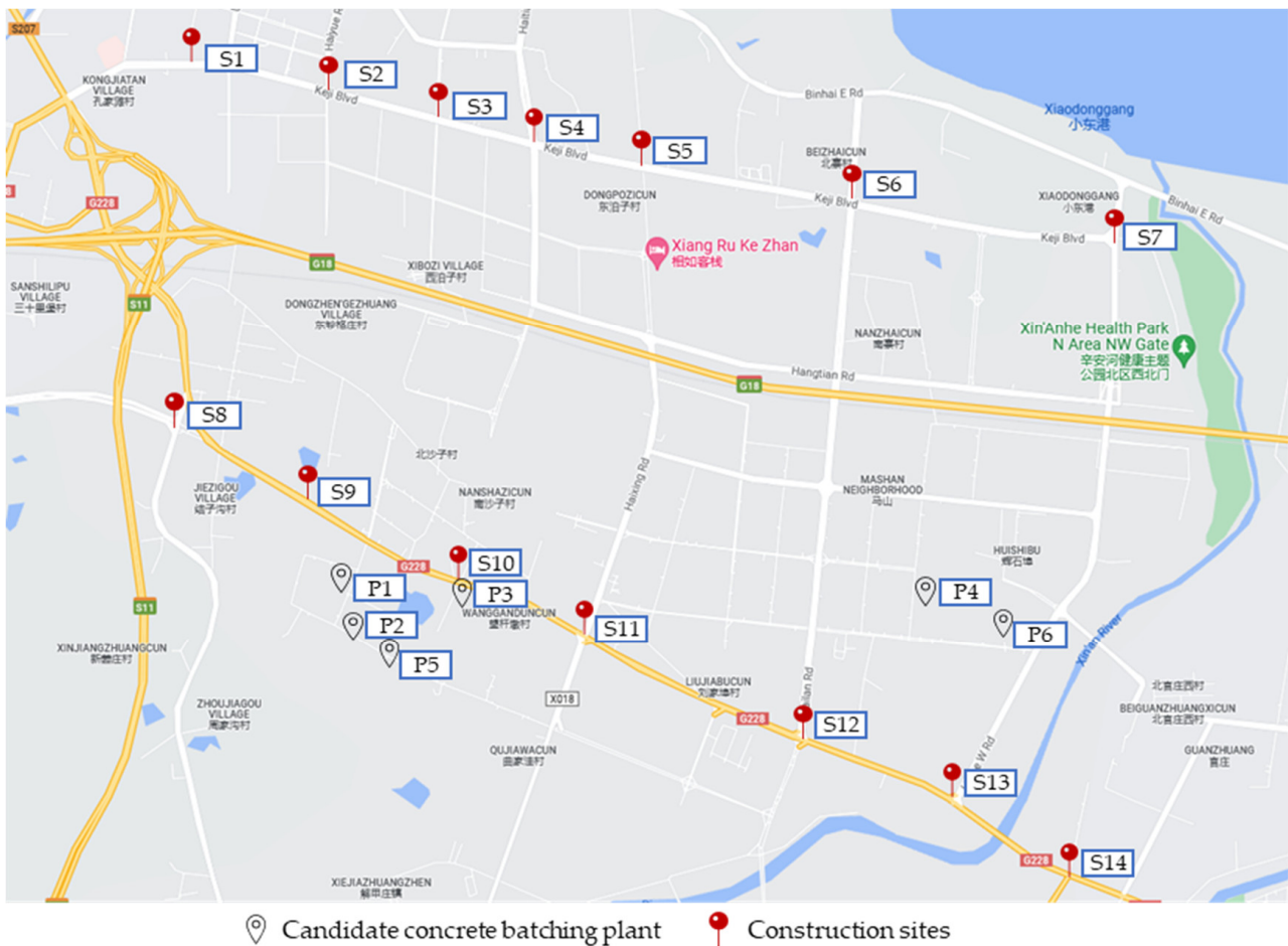
Figure 1. Locations of the candidate concrete-batching plants and construction sites.

batching plants and 14 planned stations. The locations of the candidate concrete batching plants and construction sites are presented in Figure 1.