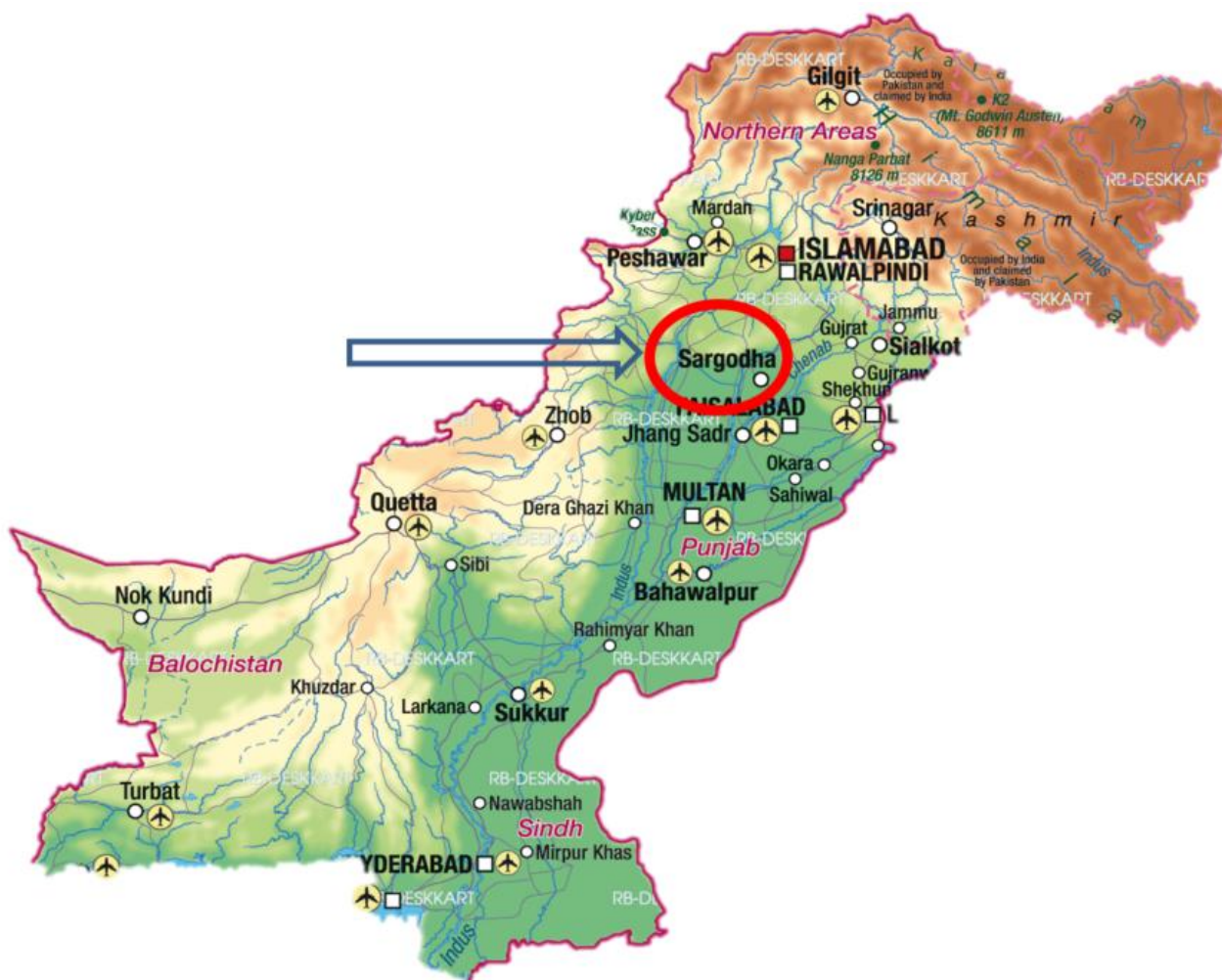
Figure 1. The map of study area.

treatment by following completely randomized design (CRD). All the organic manures were applied to each pot as 1:1 (50% organic manure + 50% loamy clay garden soil). Each pot was watered with tap water until the first leaves developed. The plants were then watered with groundwater to keep the soil moist. After 90 days after sowing, the coriander was harvested.