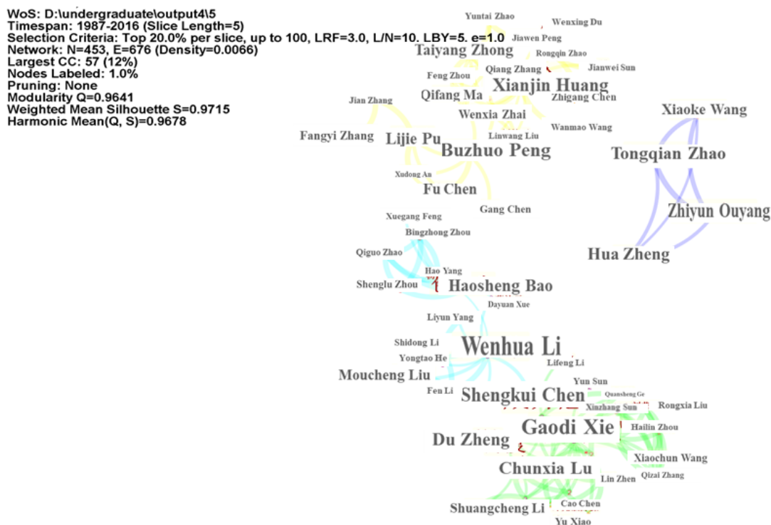
Figure 1. Co-authors network.

each other, without frequent exchanges or cooperation. Their academic connections are largely concentrated in one region. Taking Nanjing as an example, a research group has taken shape based on the city, including the Institute of Soil Science, CAS; the Department of Urban and Resources Sciences, Nanjing University; the Nanjing Institute of Geography and Limnology, CAS; and the Land Research Center, Nanjing Agricultural University.