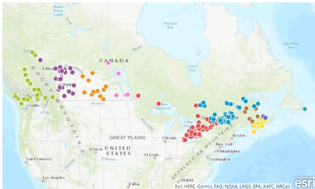
Figure S1: Geo-locations of spent EV batteries collection sites across Canada