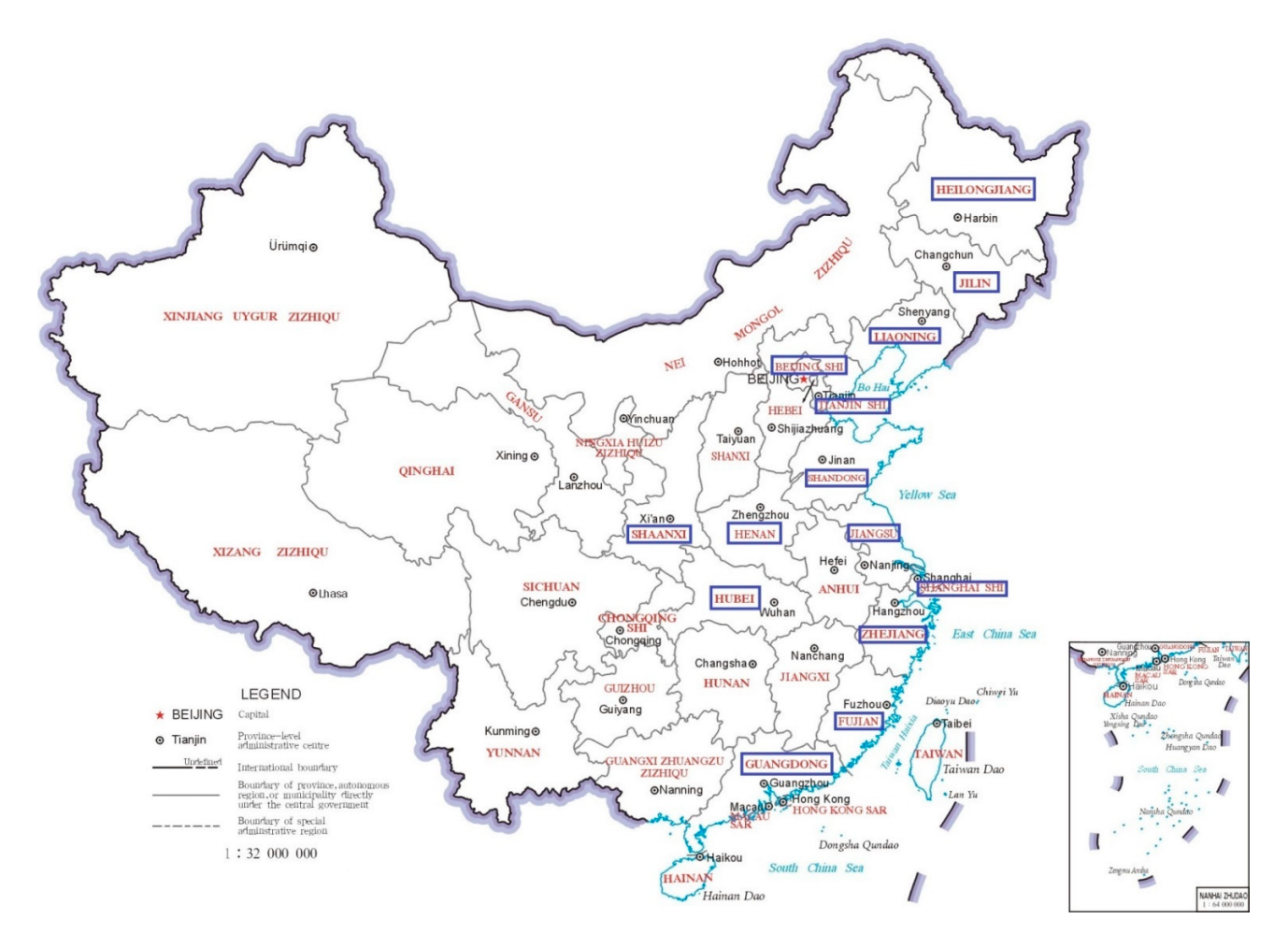
Figure 1. Location of Xinjiang classes (14 provinces and municipalities marked in the blue box).

The authors and the Editorial Office would like to apologize for any inconvenience caused to the readers by these changes. The changes do not affect the scientific results. The manuscript will be updated, and the original will remain online on the article webpage.