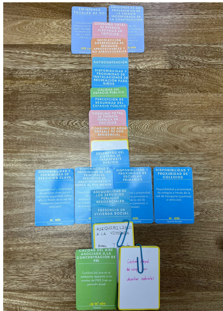
Figure 3. Ranking of indicators according to the SRF method—workshop Part 2.