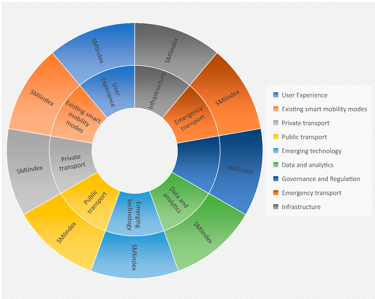
Figure 1. Structure of the smart mobility evaluation framework.

mobility and ITS solutions depends largely on an all-inclusive regulatory framework that outlines the responsibilities of all the stakeholders, including the public and private sectors, and the R&D community in ITS development and operation. Furthermore, regulations integrate current and emerging technologies seamlessly. In the Asia-Pacific region, the successes of Japan, Singapore, and South Korea in the planning, development, and operation of smart mobility could largely be attributed to the well-developed and adequate smart mobility and ITS policies, regulations, and guidelines [6].