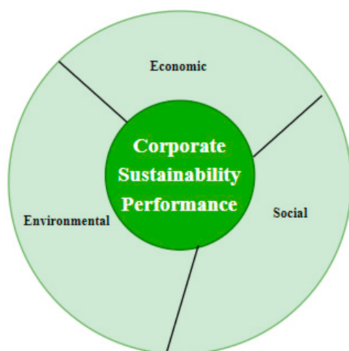
Figure 2. Triple bottom line for corporate sustainability performance.

Corporate sustainability is critical for realizing an organization's vision without jeopardizing its market advantage while meeting the demands of economic growth, environmentalism, and social responsibilities [43]. An organization's transition to a sustainable future must be realized through the effort and responsibility of executives, stakeholders, and employees [48]. In this context, corporate sustainability performance refers to an organization's capacity to effectively and efficiently utilize its limited resources over time, such as by minimizing waste and considering economic, environmental, and social sustainability performance [42]. In short, the triple bottom line (as shown in Figure 2), which incorporates social, environmental, and economic sustainability performance, means "business sustainability performance" [49,50].