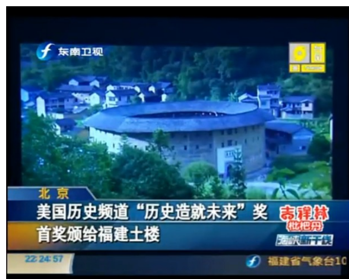
Figure 12. The First History Made for Tomorrow Grant awarded to Fujian Tulou of China by A&E Television Networks (AETN).