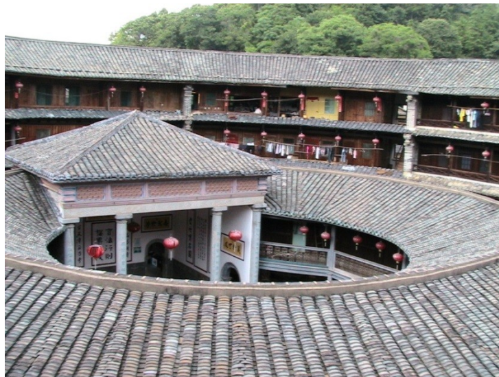
Figure 5. The 2009 anniversary celebration of inscription of Hakka Tulous into World Heritage sites.