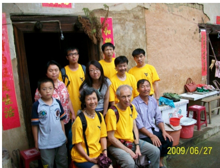
Figure 7. Group photo of the international team members researching on Tulous with the Owner of Fuxinglou.

Rammed earth walls not only stand the test of time, they leave virtually no carbon footprint.