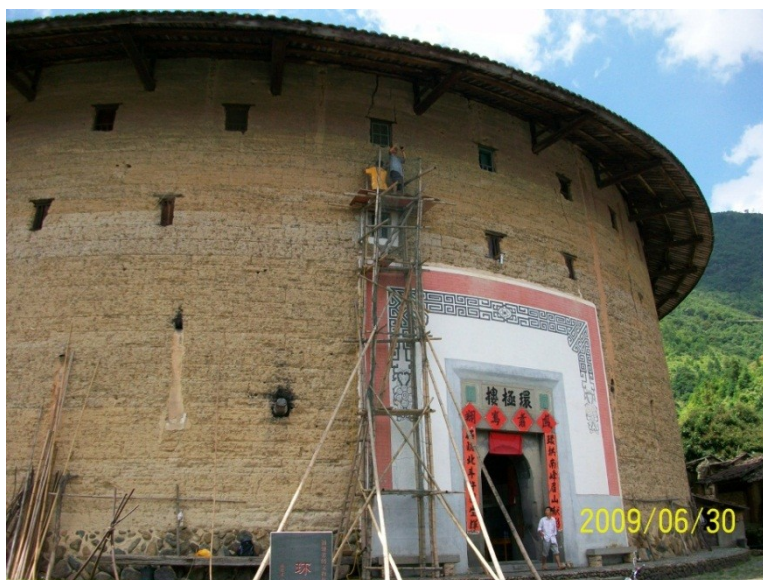
Figure 9. The researchers are investigating the crack of Huanji Tulou.

The earthen walls also work as thermal regulators. When temperatures rise in summer, heat is drawn into the walls helping to cool the air... then as temperatures drop in the winter, heat is released for natural warming.