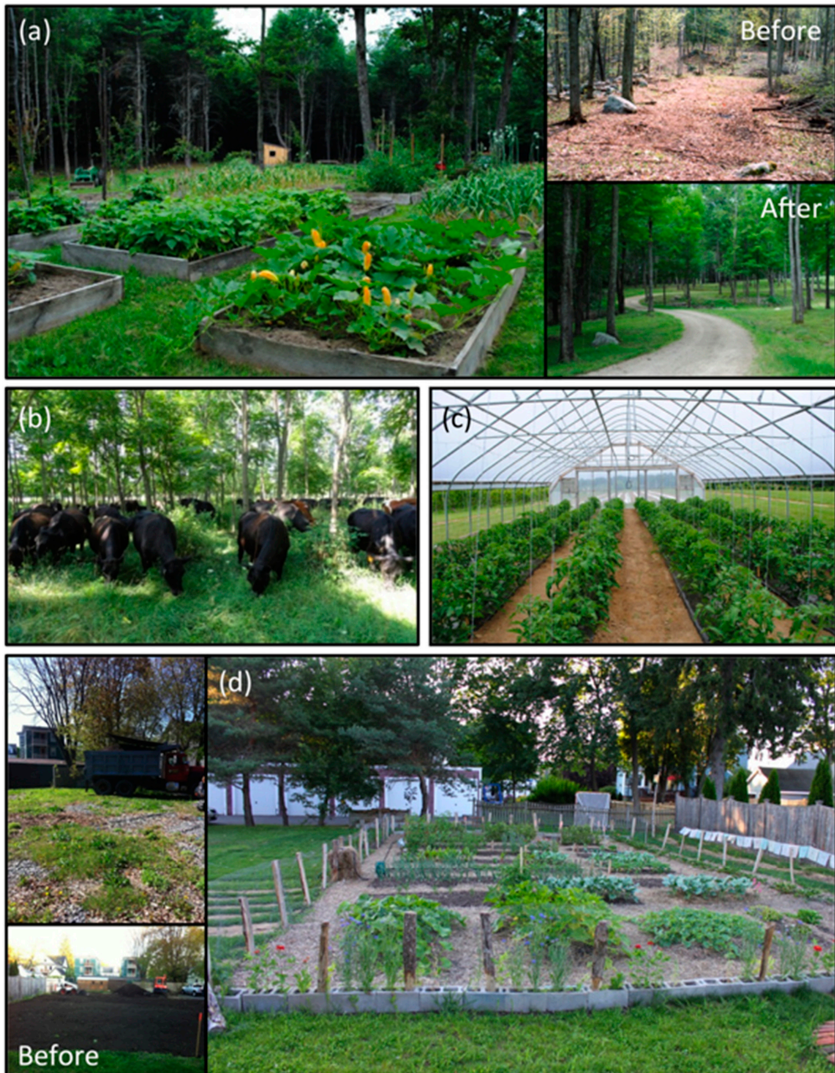
Figure S1. Examples of agricultural land-use changes occurring in the Northeast US (a) extensification via a newly established farm in what had previously been second-growth forest (see inset photos); (b) extensification via silvopastoral livestock production within a managed forest stand; (c) intensification via tomato production in season-extending high tunnels; and (d) reclamation via a new community garden that replaces an empty urban lot following site preparation (see inset photos).