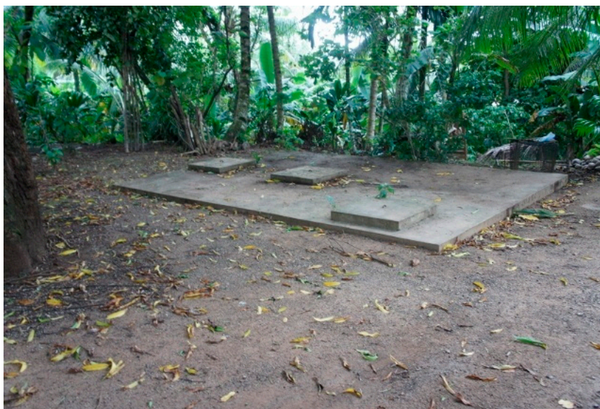
Figure 3. Large communal septic tank used in remotely located Daabach Village on Yap.

With the assistance of the Yap EPA, it was considered reasonable to conduct a thorough inventory of communal septic tanks (Figure 3), such as those found at Community Health Centers (Table 1), Early Childhood Education Centers (Table 2), Elementary Schools (Table 3), and other miscellaneous facilities (Table 4). The general condition and functionality of each unit was documented and their precise locations determined by GPS. The GPS data, however, are not repeated in this report, but are made available separately for use by appropriate authorities.