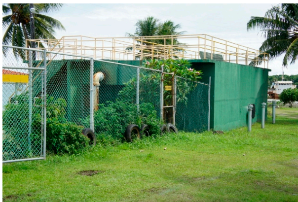
Figure 7. Imhoff tank sewage treatment plant in Colonia, Yap.

tanks are very user friendly and have low operational costs due to the absence of aeration and internal recycle. According to the operational manual of the plant, the system was designed for removal of 25% of the biochemical oxygen demand and 60% of the suspended solids from the raw wastewater. There are no records, though, of any data ever being collected and there is no on-island capability for conducting such analyses. The solids that settle in a compartment below the flow channel are subject to some degree of anaerobic digestion depending on the retention time. These solids are periodically expelled under the natural hydraulic head in the system, thus eliminating the need for mechanical pumping. No chemical or other biological treatment is employed in the plant, hence the effluent, which is being discharged to the ocean, is not much different from raw sewage. Furthermore, the 1000-ft (300 m) outfall is known to be broken open at approximately 500 ft (150 m) from the shore. As a consequence, it is discharging sewage at a depth of 10 to 20 ft (3 to 6 m) near the industrial district of Colonia about half a mile (one kilometer) from the main business district. However, testing by the Yap EPA in the coastal zone has yet to yield a count of greater than 30 Enterococci per 100 milliliters of sea water, which would be considered a potential danger to public health.