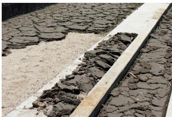
Figure 12. Air dried sludge with an estimated 50% solids content.

Rigorous bacteriological testing should be used to evaluate the compost product prior to use. However, if any questions concerning safety should emerge due to a lack of testing, applications avoiding contact with food crops could readily be employed. Public perception on the use of treated