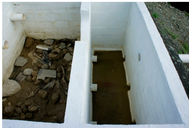
Figure 6. Detailed view of the sand filtration unit process at the new landfill.