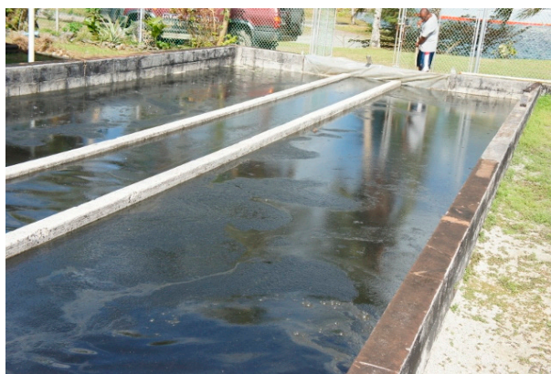
Figure 11. Fresh wet sewage sludge in drying bed at beginning of drying period.