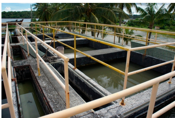
Figure 8. One flow line in the Imhoff tank sewage treatment plant.

To upgrade the process to a conventional activated-sludge based secondary level of treatment, a completely new plant would have to be constructed with a larger footprint including space for a clarifier unit process. Such a facility would require substantial capital and operation and maintenance costs. Another method worthy of consideration that could harness biological treatment power with