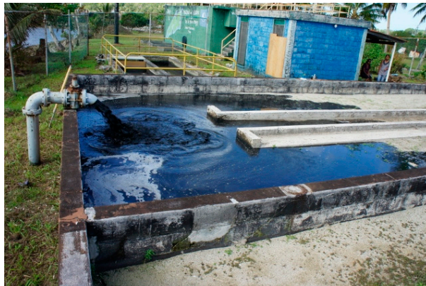
Figure 10. Sewage sludge from Imhoff tank being discharged to drying bed.

procedures should be obtainable ( i.e. , 30 days active composting with internal temperatures of 55 °C (130 °F) or higher for 15 days [14]). By this, the final product can be reasonable assumed to meet Class A standards, though further consideration should be given to levels of heavy metals and vector attraction reduction [12].