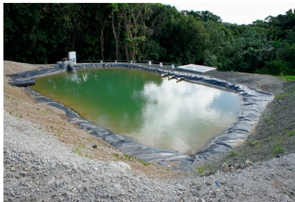
Figure 5. Leachate collection pond at the new landfill. White box on far side of pond is the sand filtration unit.