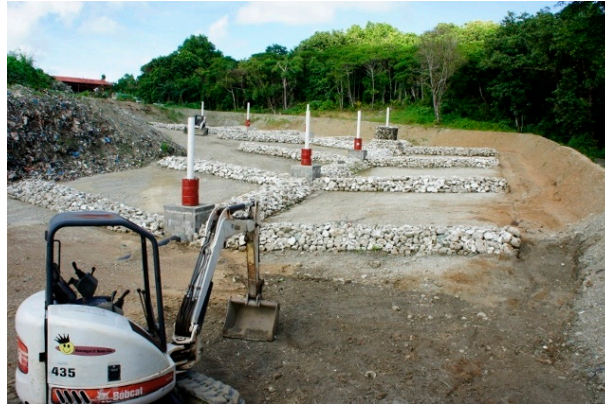
Figure 4. Newly constructed Fukuoka-type landfill on Yap prior to first use.