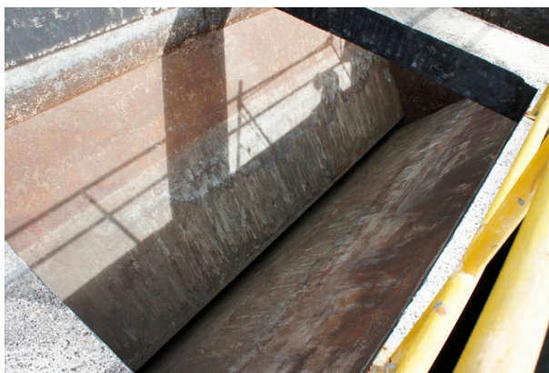
Figure 9. Imhoff tank emptied for inspection showing compartment where biocarrier matrix could be inserted.

a relatively simple addition to the existing facility would be to use an attached-growth (or biofilm) process [9,10]. Using this method, effective biomass could be retained in the unit process by use of a biocarrier support matrix. Potentially, as a relatively simple retrofit, biocarrier material could be attached to a frame and positioned in the existing tank so as to intercept the flow path of the wastewater. Figure 9 shows the interior of one of the Imhoff tanks drained for inspection, where such a frame could be inserted. Evaluation of such an attached-growth process would be an avenue for future research and development.