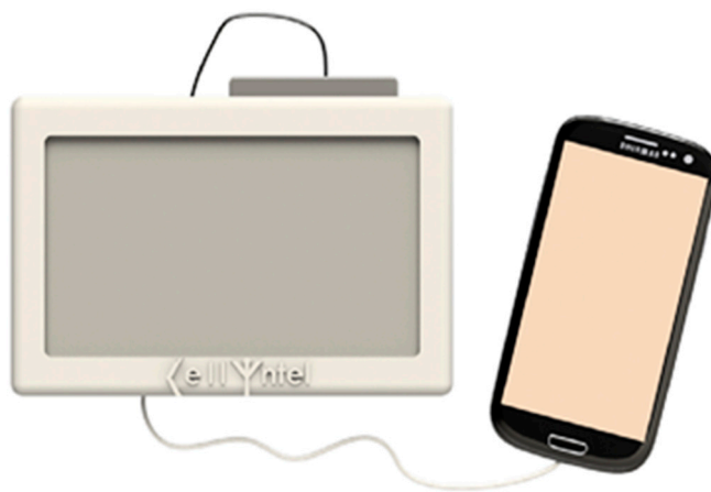
Figure 1. Computer aided design (CAD) rendering of the CellIntel prototype connected to a mobile device.

The prototype device was designed with several key characteristics in mind, which were: (i) lower cost; (ii) touchscreen; (iii) smaller than competitors; (iv) lighter than competitors; (v) easier to assemble; (vi) ability to connect to different mobile devices; and (vii) manually assembled. Thus, the adoption of 3D printing technology to produce the device allows a minimal initial investment for the production equipment, low unit cost, product portability, custom design, and ease of assembly. The project began with the acquisition of two desktop 3D printers, which were not excessively expensive, whose cost lies in the range of $3000 to $10,000. As the precision and the surface finishing of a 3D printer increase, the price rises too. The design of the casing was realized with 3D CAD (Figure 1).