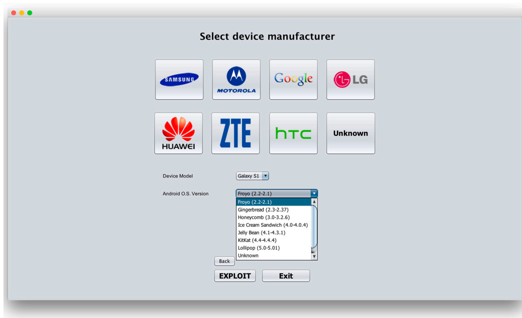
Figure 2. CellIntel prototype user interface during data extraction of an Android smartphone.

The empirical testing performed during the study showed positive results in producing the prototype using the aforementioned techniques. The prototype has similar functionality and improved usability when compared to rivals. After the collaborative hardware and software design described in the previous sections, the CellIntel prototype was produced with a S250 Tiertime 3D printer and was then manually assembled. Subsequently, the software was installed on the device (Figure 2).