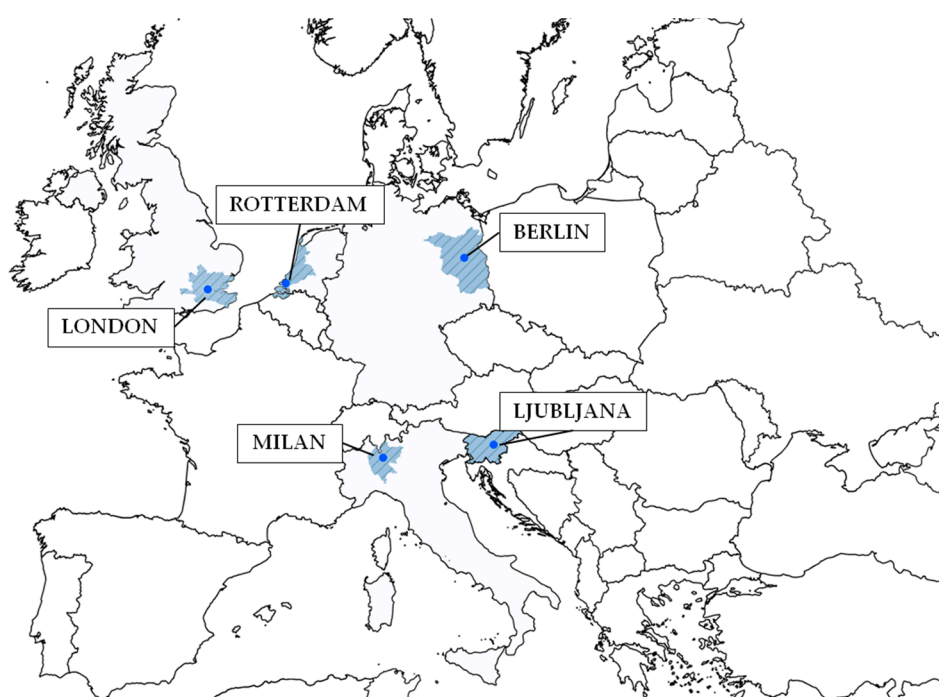
Figure 1. Case study areas are shown in dark gray. Circles indicate the location of their respective main urban centers.

1 Based on the Herfindal–Hirschman Index: 0 for a markedly polycentric structure; 10,000 if the whole region coincides with a single municipality.