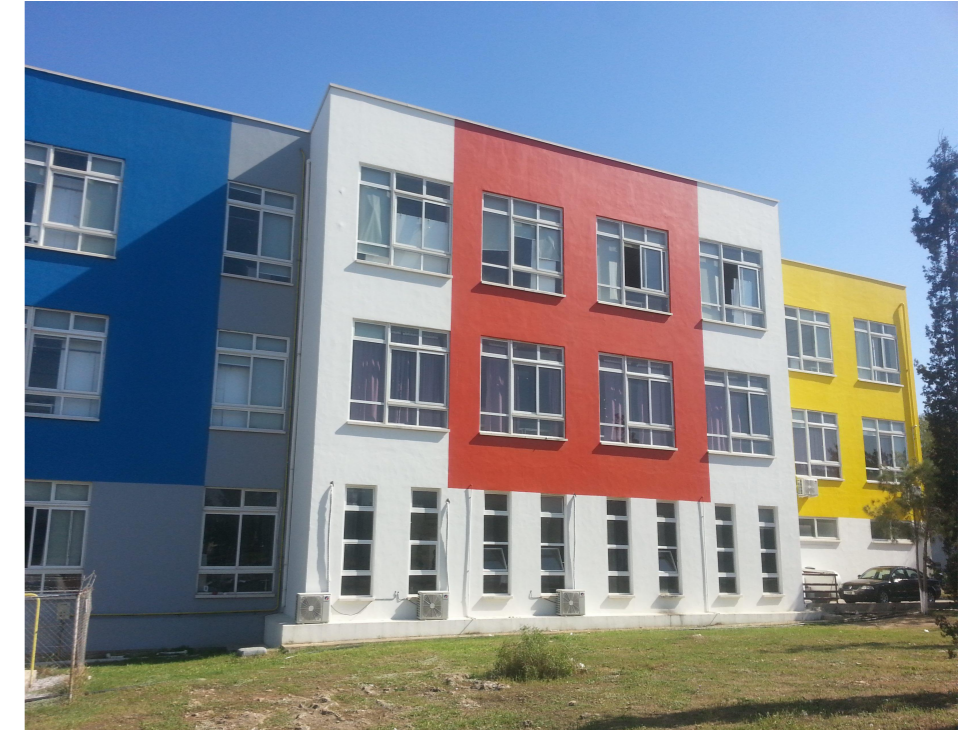
Figure 2 Existing situation