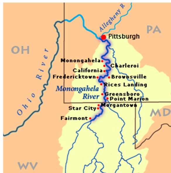
Figure 1. The “River Towns” of the Monongahela River.

despite the intervention of numerous regional economic revitalization programs funded by the federal and state governments.