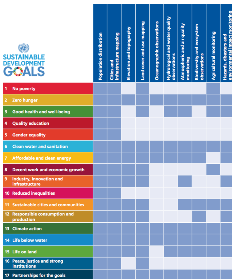
Table S1. Earth observation and geospatial information resources for SDG monitoring.