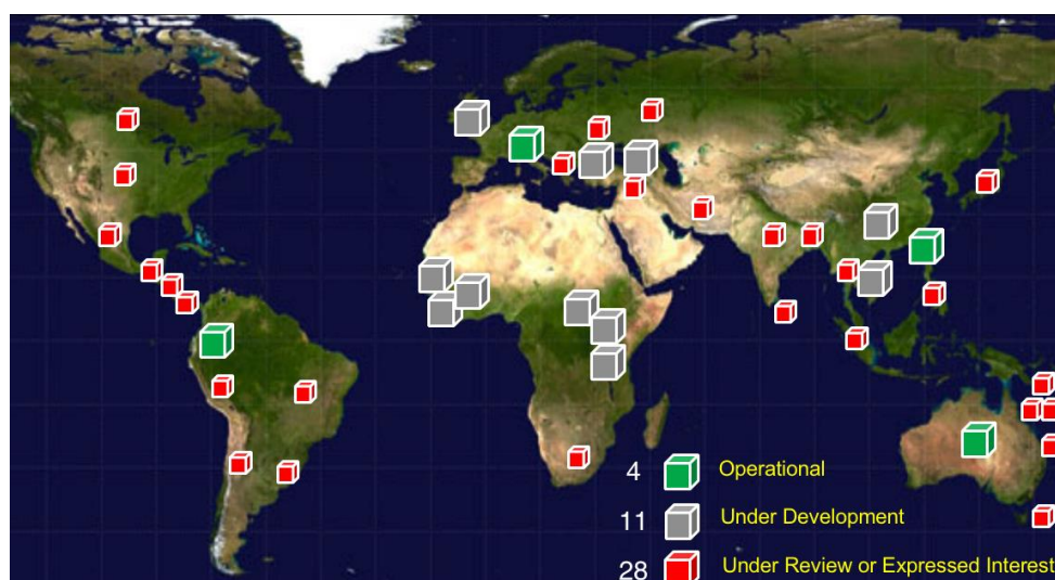
Figure S1. CEOS Data Cube products by status [5].

The Committee on Earth Observation Satellites (CEOS) currently has four operational Data Cubes in Australia, Colombia, Switzerland and Africa, with an additional eleven Data Cubes in development and 28 under review (43 total)[5]. As these Data Cubes become more prevalent, this will create more opportunities to perform analyses and make comparisons between countries based on satellite imagery data.