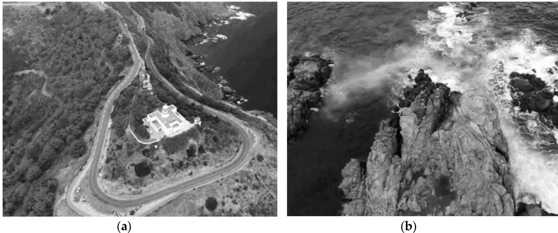
Figure 2. Aerial view of landforms and the coast: (a) UAVs allow students to know the complexity of the terrestrial landscape, the characteristics of elevations and depressions in the lithosphere. They also allow in-depth observation of the great forms of the relief: ancient massifs, sedimentary basins, or sedimentary plains and mountain ranges of recent formation. (b) UAVs used for remote sensing allow students live knowledge about the two main phenomena of marine erosion: sea currents and waves. Also, this tool makes it possible to know the effects of maritime erosion: cliffs, abrasion platforms, coastlines, sea caves, and peninsulas.

All this has been reflected in the educational field, where it has been shown that innovative teaching methods such as e-learning [61], project-based learning [62], mobile learning [63], and research-based learning [64] are effective training methodologies in combination with remote sensing. On the contrary, the use of traditional teaching methods such as the exposition method [65] does not imply major improvements in the academic indicators of the students, as do the previously mentioned methodologies [66].