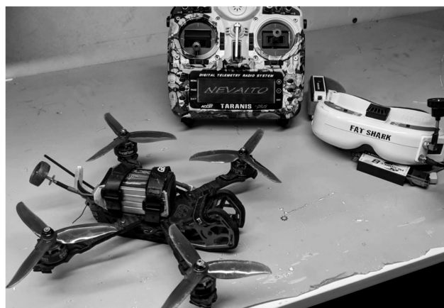
Figure 1. UAV (unmanned aerial vehicle) used for remote sensing.

The constant advancement of geospatial technologies and their integration in UAV (Figure 1) makes it a suitable methodological resource to be used in university content and careers related to geography [59,60]. UAV allow you to capture images of various landscapes (Figure 2). This speeds up and facilitates the approach of students to the natural environment of their context.