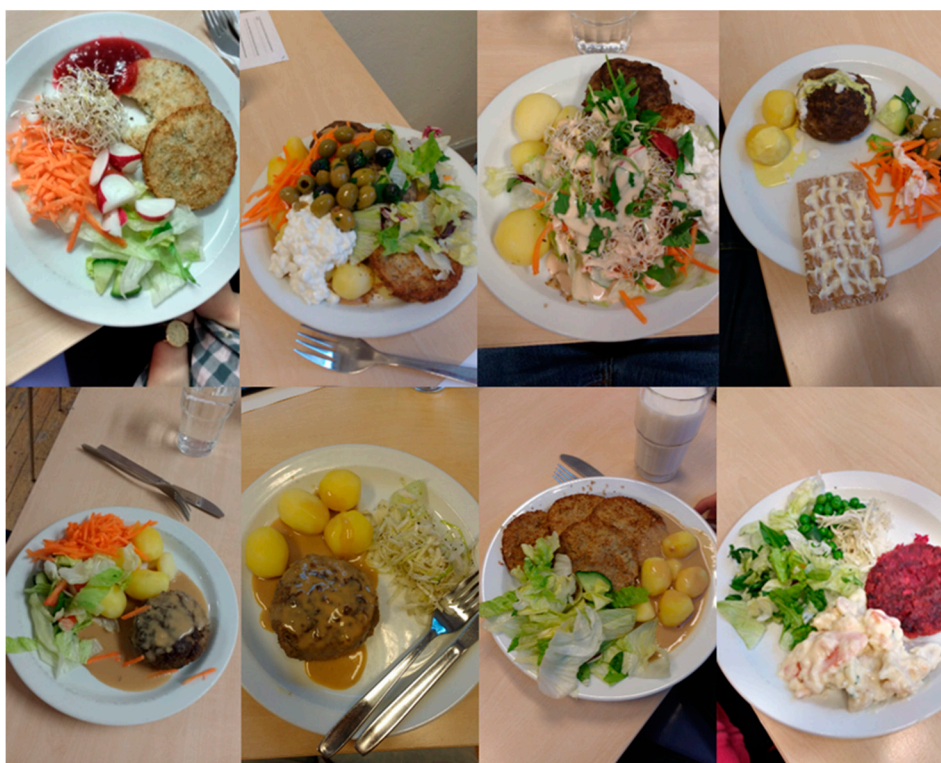
Figure 4. Food choices among a sample of the included students.

The reliability of food intake was analyzed based on the following: (1) systematic changes in the mean of repeated meals, (2) absolute reliability (i.e., within-subject random variation expressed as a coefficient of variation (noise)), and (3) relative reliability expressed as a retest intra-class correlation (rank of students in comparison to the group) from one meal to the other [23].