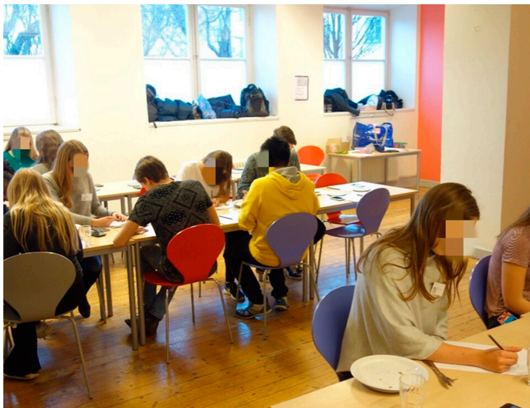
Figure 1. The lunchroom where the participating students ate their lunches.

Normally, students have 25 min to collect and eat their food and the school lunch routine was strictly kept during the current study. Furthermore, the study was part of a technological EU project (SPLENDID) with the intention to develop a personalized guide for eating and activity behavior for the prevention of obesity and eating disorders [19,20].