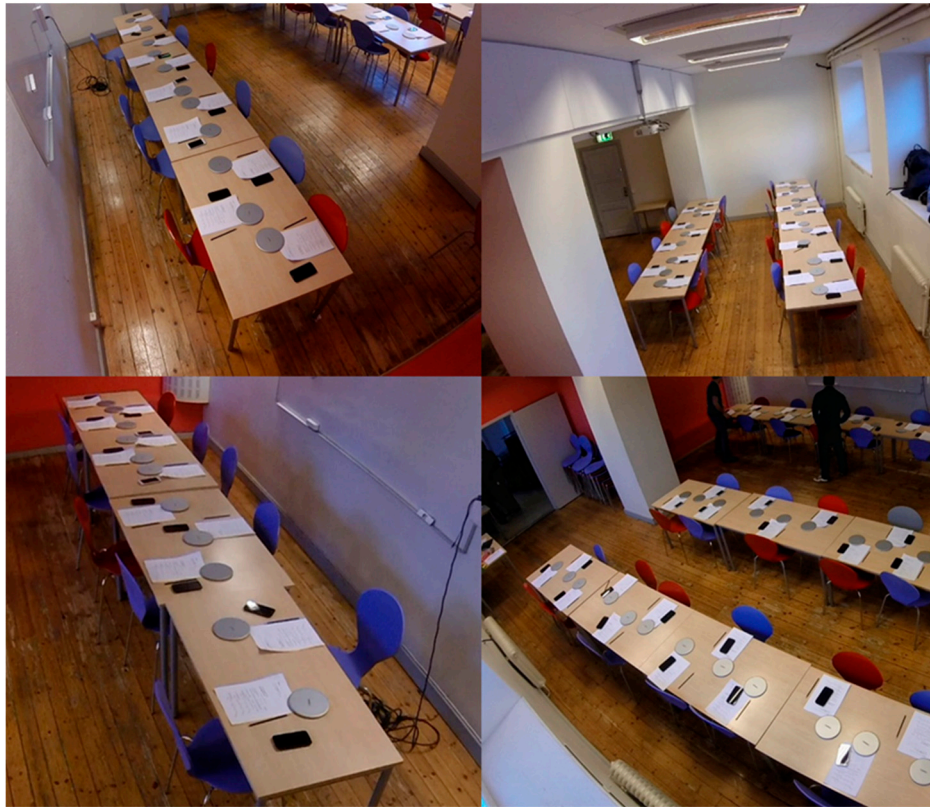
Figure 3. Placement of the cameras recording students during their lunches.