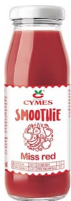
Figure S1. Smoothie.