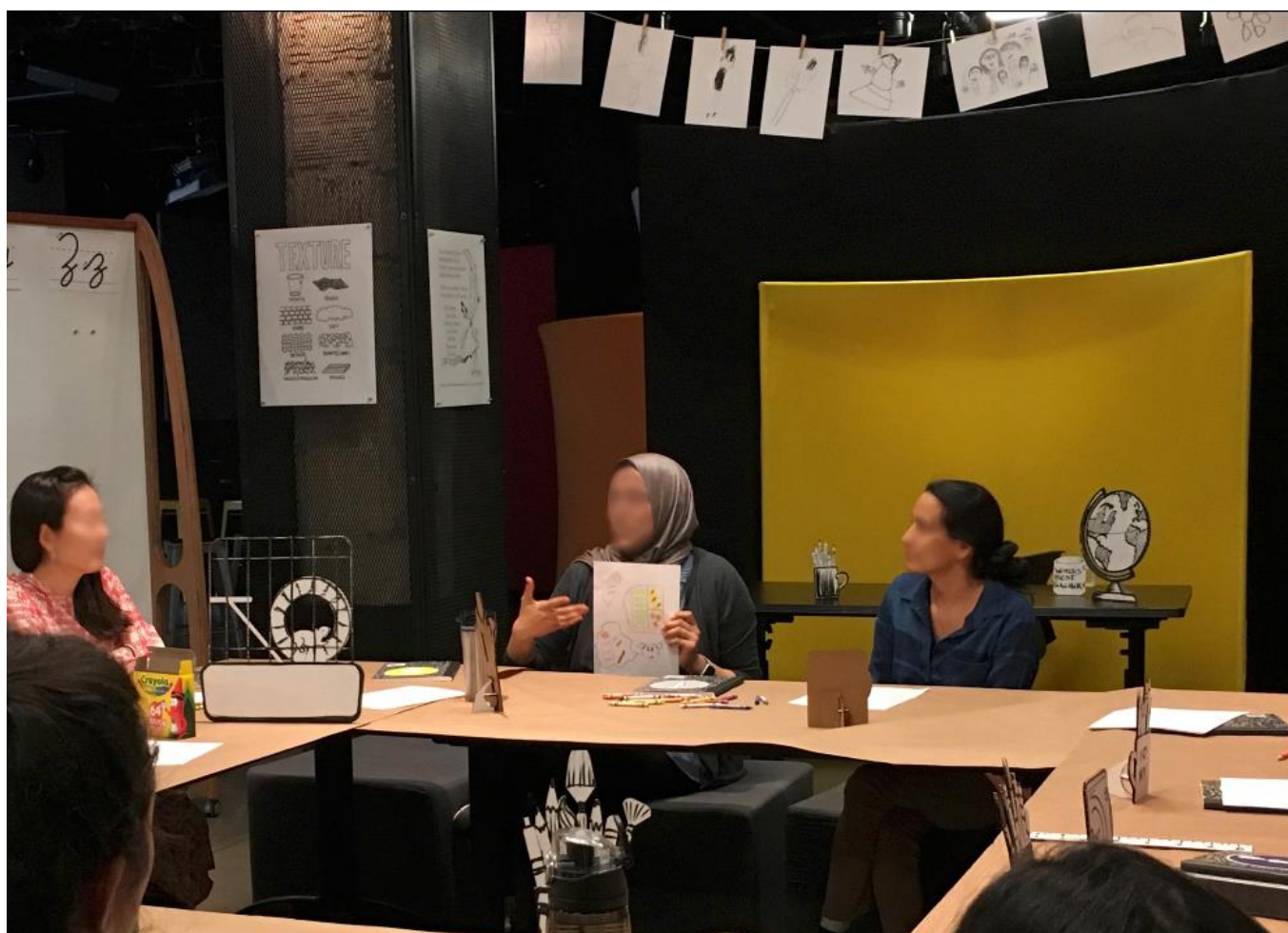
Figure 1. Image from section one of a practice workshop to display the research space and activity. The individuals in the photographs are not the research participants.

In the first section, the teachers were asked to reflect on their childhood school lunch experiences and then asked to draw a memory using paper and crayons. When finished, the teachers were asked to verbally share their drawings and experiences with the group, focusing on how their experiences impacted their current perceptions and practices related to school lunch. Immediately following the first section, the second section explored teachers' recommendations to encourage greater school lunch participation. The teachers were divided into teams of two or three people and briefed by a video recording from a fictional school principal, explaining a hypothetical new school wellness policy that mandated all teachers speak to their students about the daily lunch served in the cafeteria. Based on this video, the participants were provided a sample menu and were asked to discuss as a team, then deliver to the group three recommendations for how to engage, entice and encourage their students to eat school lunch. These first two sections were used to inspire teachers to think about school lunch and to enable in-depth discussions during the third section. Figure 1 is a photograph from the first section of the workshop displaying the research space and activity.