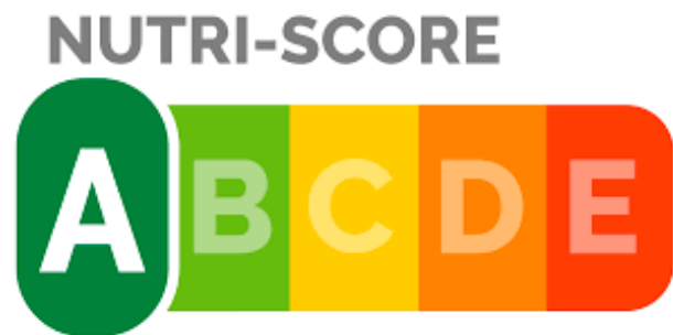
Figure S1. Template of front-of-pack labels in the comparative studies