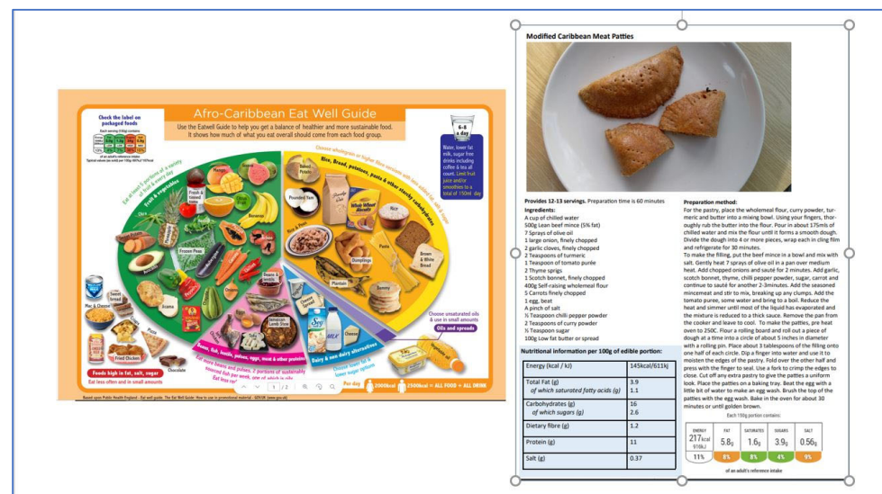
Figure 1. The two codeveloped food-based resources on healthy eating used in the intervention session. (Left) The African Caribbean Eat Well Guide used in session 1. (Right) One of the 12 healthier traditional recipe resources (Meat Patties) used in session 2.

interventions [17]. Intervention development and session format also incorporated input from staff at the community organization, which served service users from diverse groups, including people of first- and second-generation African Caribbean ethnicities. Across the two sessions, the intervention objectives were to (1) introduce participants to the two new food-based healthy eating resources, (2) contextualize these in healthy eating recommendations, and (3) provide hands-on experience preparing, cooking, and tasting the recipes.