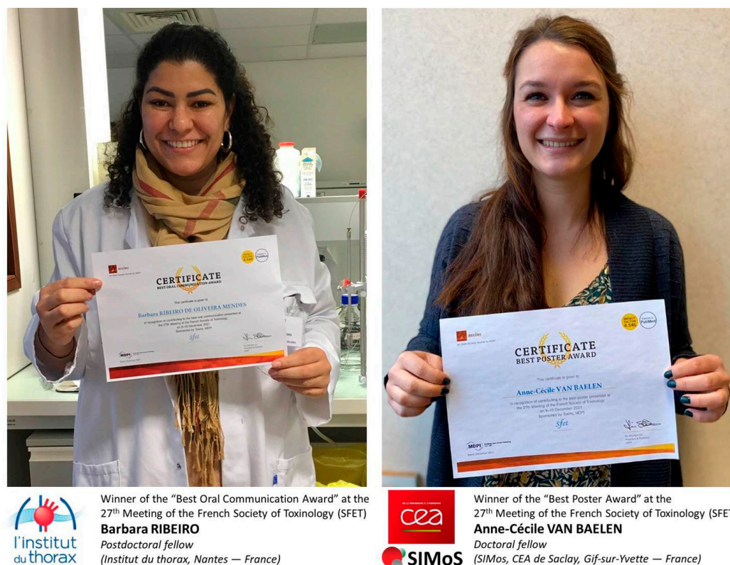
Figure 2. Winners of the “Best Oral Communication” and “Best Poster” Awards at the 27th Meeting of the French Society of Toxinology (SFET).

Owing to a donation from MDPI-Toxins, two prizes of EUR 300 each were awarded to the best oral communication and the best poster (Figure 2), both selected from a vote by all the participants to the meeting.