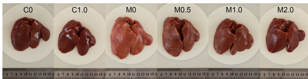
Figure 1. Representative livers from broilers (42 days old) fed different diets. C0, the negative control diet; C1.0, the negative control diet plus 1.0 g B. subtilis ANSB060 /kg diet; M0, the aflatoxin-contaminated diet; M0.5, the aflatoxin-contaminated diet plus 0.5 g B. subtilis ANSB060/kg diet; M1.0, the aflatoxin-contaminated diet plus 1.0 g B. subtilis ANSB060/kg diet; M2.0, the aflatoxin-contaminated diet plus 2.0 g B. subtilis ANSB060/kg diet.