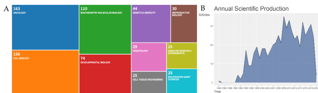
Figure 1. (A) Web of Science (WoS) categories. Visual representation of classification methods for scientific literature on Cripto research. Ten fields of knowledge were retrieved from the WoS repository: Oncology ( n = 163 ), biochemistry and molecular biology ( n = 110 ), genetics heredity ( n = 44 ), reproductive biology ( n = 30 ), cell biology ( n = 156 ), developmental biology ( n = 74 ), hematology ( n = 29 ), medicine research experimental ( n = 25 ), cell tissue engineering ( n = 25 ), and multidisciplinary sciences ( n = 25 ); (B) annual scientific production on Cripto research. Growth of the annual number of documents in the Cripto research field from 1900 to 9th April 2020.

The systematic approach we undertook helped to curate the Cripto research fields into logical categories. We performed a temporal screening and showed that Cripto has received increased attention and interest by researchers over the last two decades. For the last 10 years, a total of 271 documents fit the search criteria across eight document types (DT). The eight document types were articles ( n = 212 ), editorial material ( n = 1 ), letters ( n = 3 ), meeting abstracts ( n = 40 ), reviews ( n = 14 ), and a review-book chapter ( n = 1 ), and the most three relevant sources were Cancer Research ( n = 13 ), PLoS ONE ( n = 9 ), and Development ( n = 8 ). A further breakdown of the research was based on the following ten WoS categories: oncology ( n = 163 ), cell biology ( n = 156 ), biochemistry molecular biology ( n = 110 ), developmental biology ( n = 74 ), genetics heredity ( n = 44 ), reproductive biology ( n = 30 ), hematology ( n = 29 ), cell tissue engineering ( n = 25 ), medicine research experimental ( n = 25 ), and multidisciplinary sciences ( n = 25 ) (Figure 1A). The research content of each category was further organized into more comprehensive branches of disciplines, in order to combine the research work and form more structured categories.