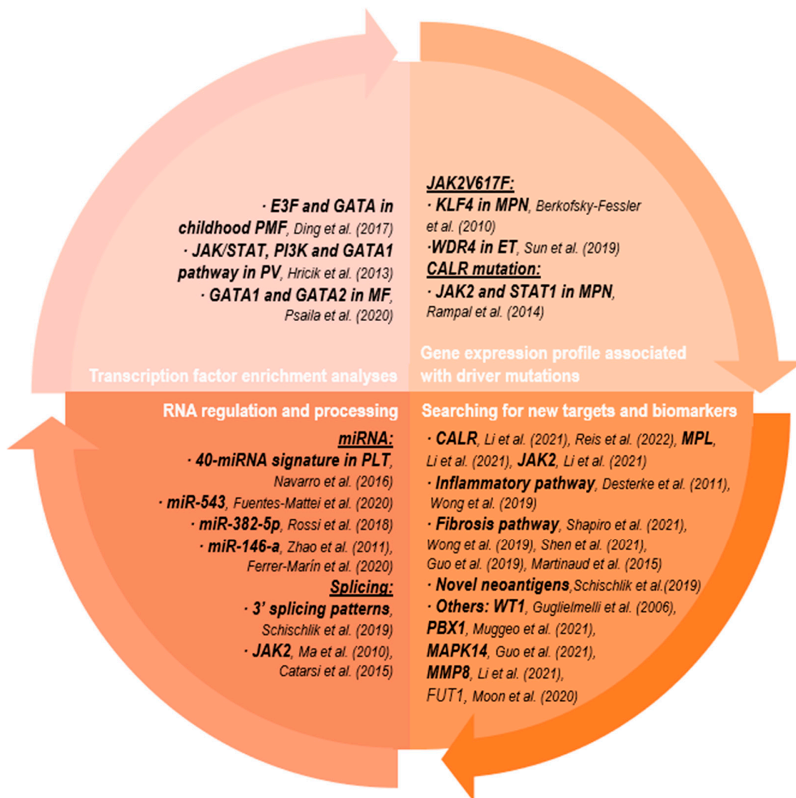
Figure 1. Main results of transcriptomic studies on MPNs. The corresponding references [49,56–81] are cited in the figure. Abbreviations: MF, myelofibrosis; PV, polycythemia vera; PMF, primary MF; MPN, myeloproliferative neoplasm; ET, essential thrombocythemia; PLT, platelets.

other factors in the development and progression of these neoplasms. Thus, the phenotype is not solely determined by the genomic profile, and disturbances in DNA transcription to mRNA or its translation to protein may be even more important. Here, we will describe some relevant studies that have endeavored to detect disturbances at the RNA level, whether at the gene expression level, splicing process or RNA regulation. The main studies explained in this section are summarized in Figure 1.