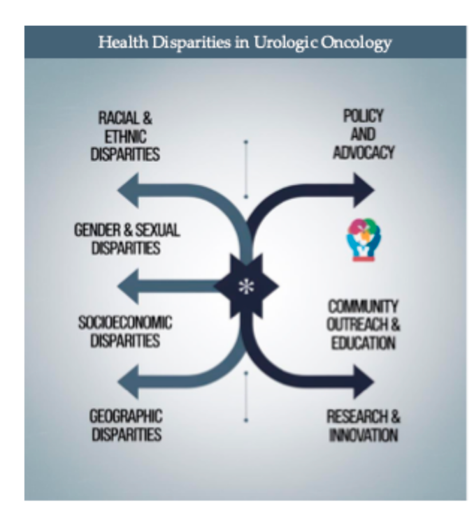
Figure 2. The figure illustrates key dimensions of health disparities in urologic oncology—including racial and ethnic, gender and sexual, socioeconomic, and geographic disparities—and the corresponding strategies for addressing them, such as policy and advocacy, community outreach and education, and research and innovation.

The primary objective of this narrative review is to provide a comprehensive examination of health disparities within urologic oncology, with a particular focus on how these disparities influence treatment decisions and clinical outcomes. Figure 2 summarizes the dimensions of health disparities in urologic oncology discussed in this review.